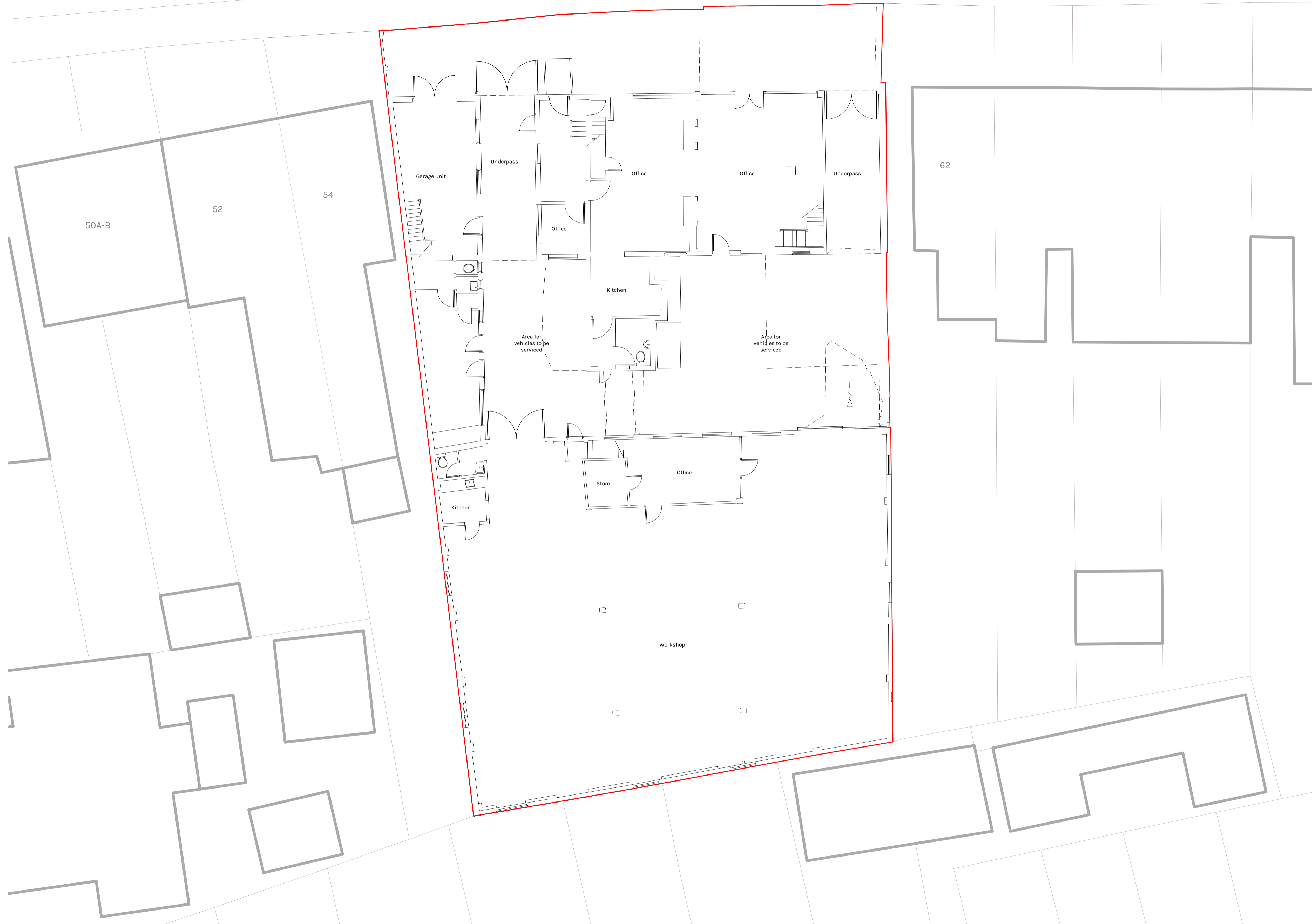
1 Existing Ground Floor Plan 1:100