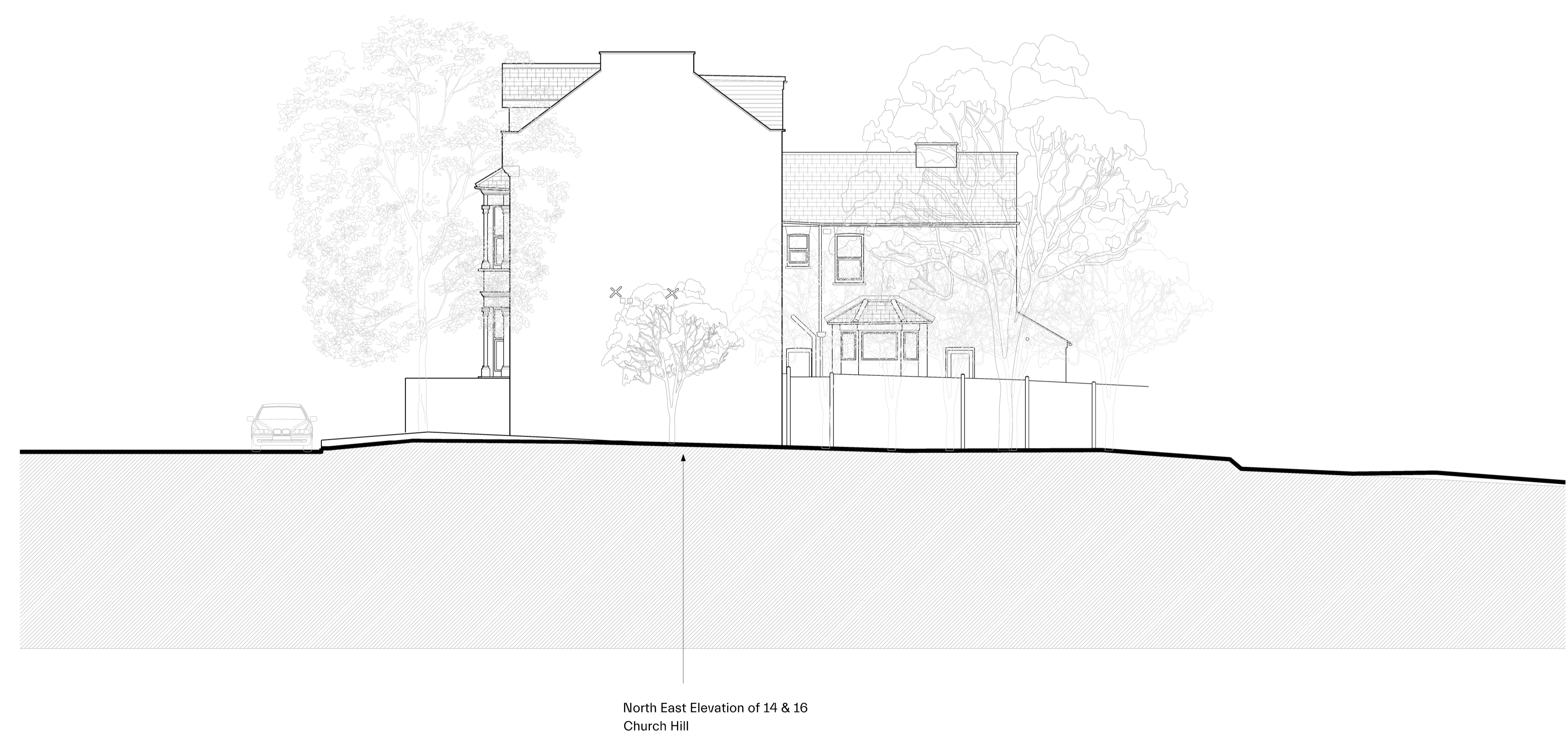
North East Elevation of 14 & 16 Church Hill