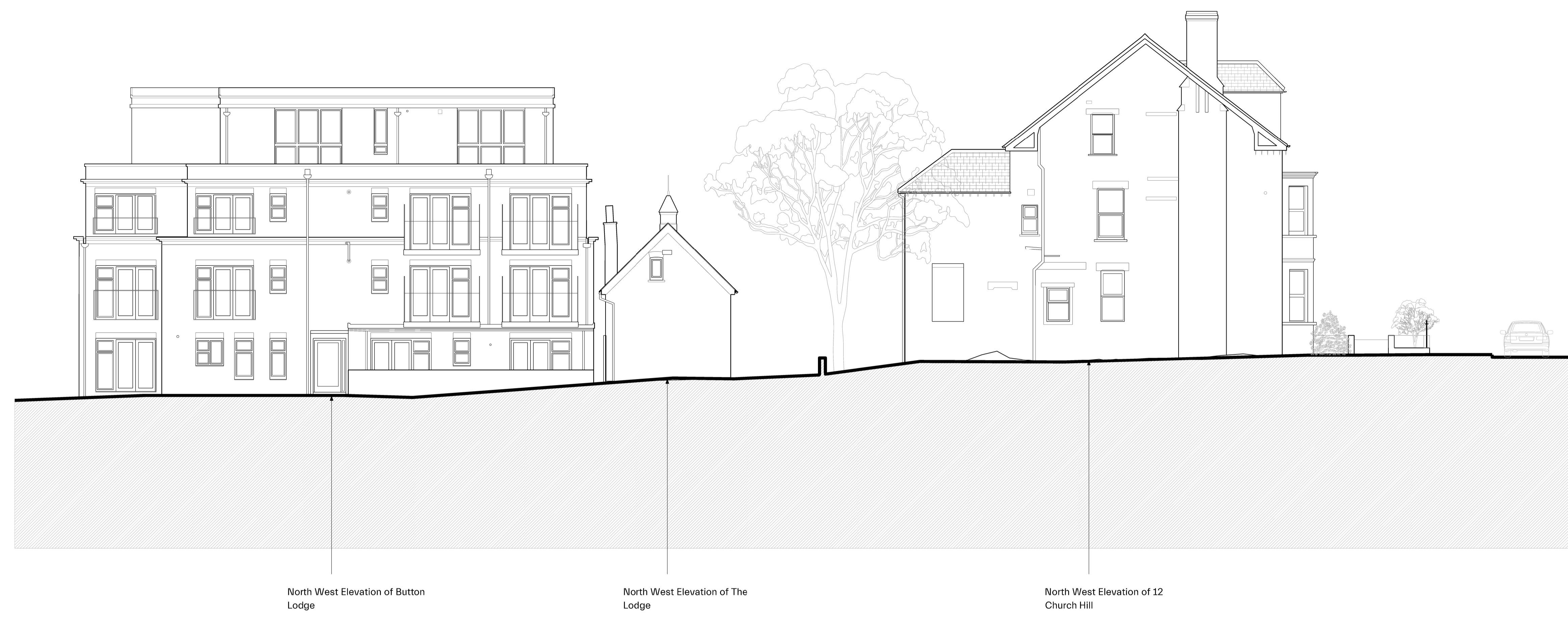
North West Elevation of Button Lodge