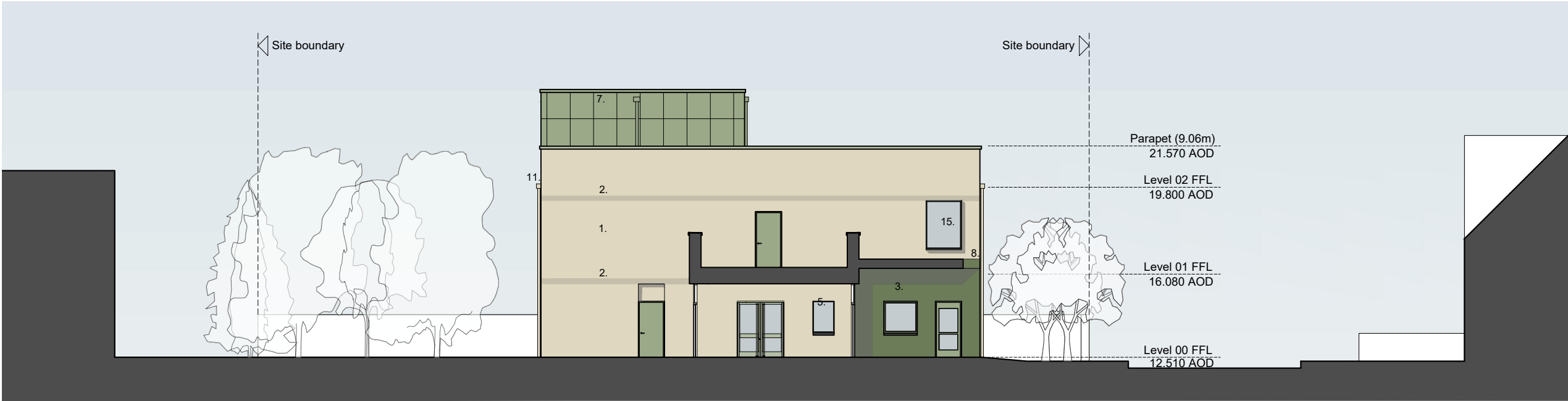
Proposed Elevation 6 - East through Link