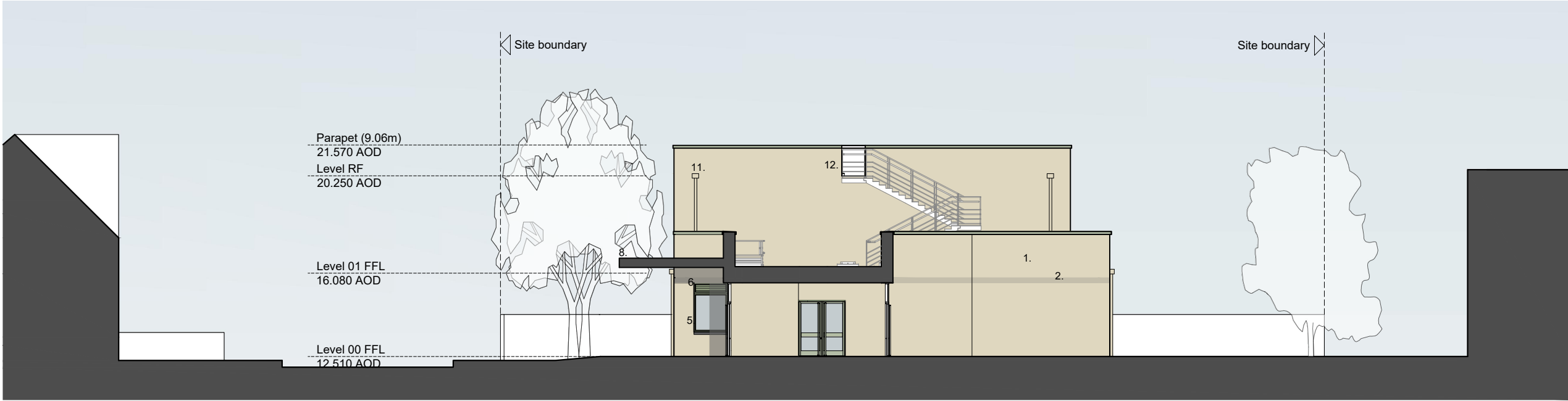
Proposed Elevation 5 - West through Link