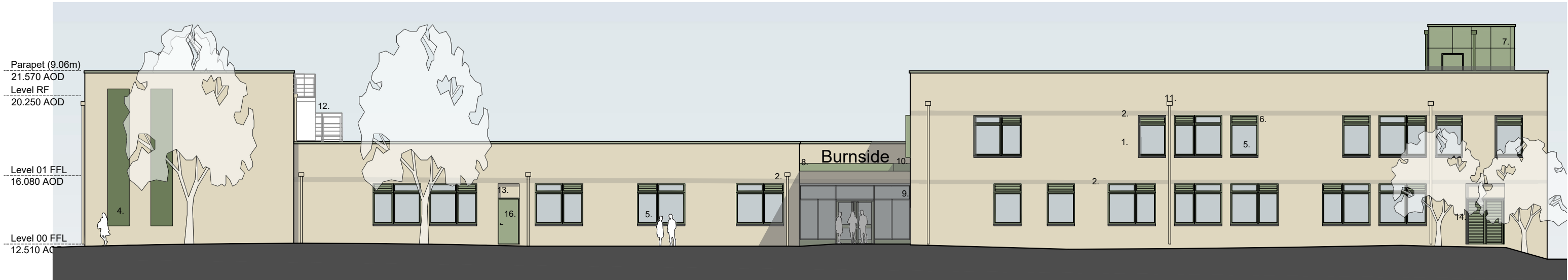
Proposed Elevation 1 - North