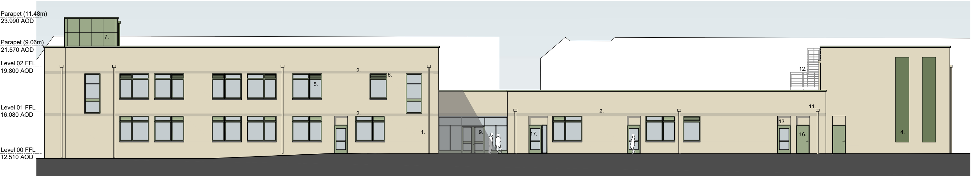
Proposed Elevation 2 - South