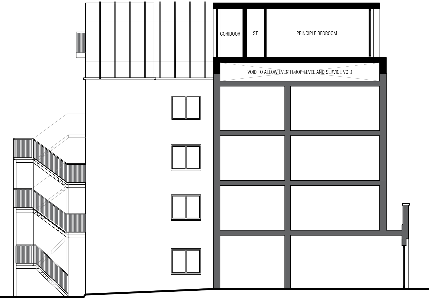
PROPOSED INTERNAL ELEVATION 06