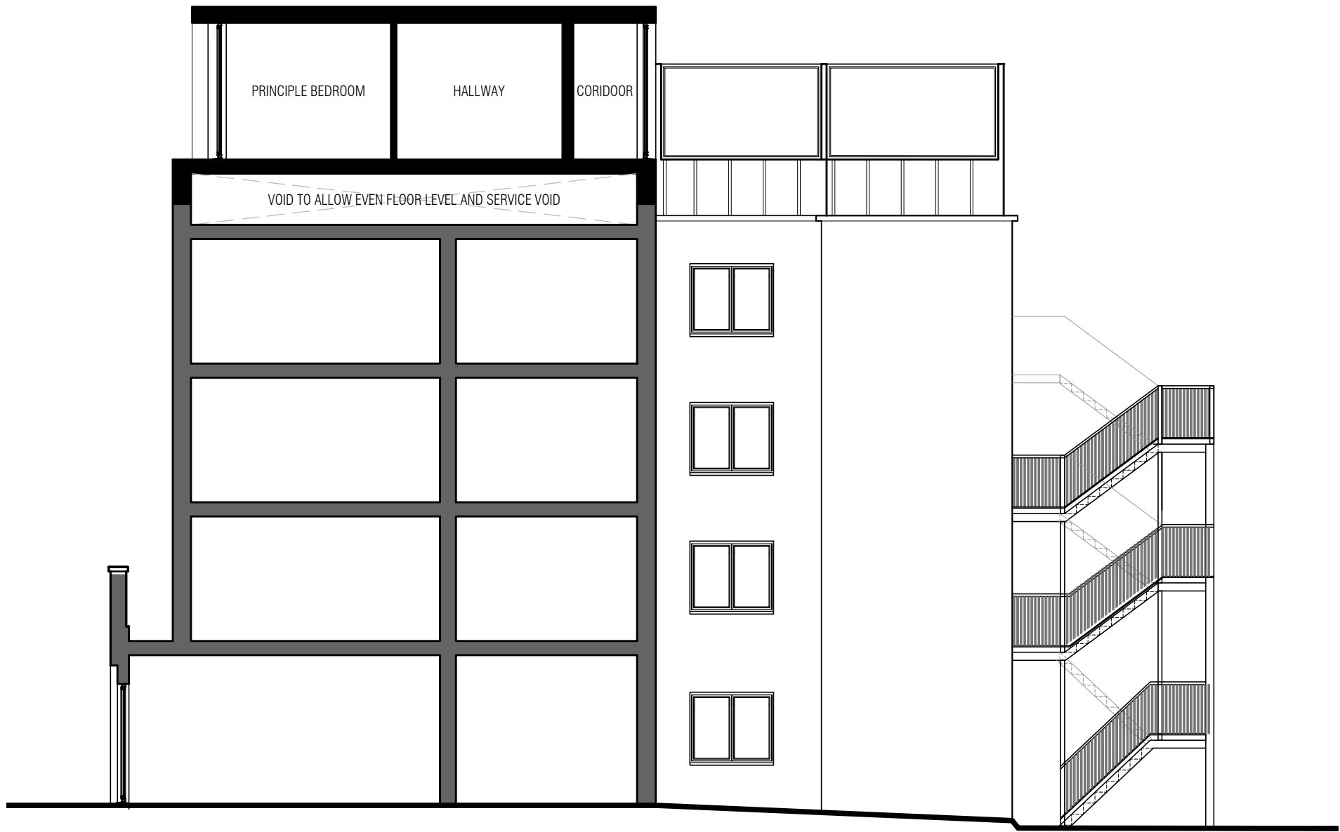
PROPOSED INTERNAL ELEVATION 03