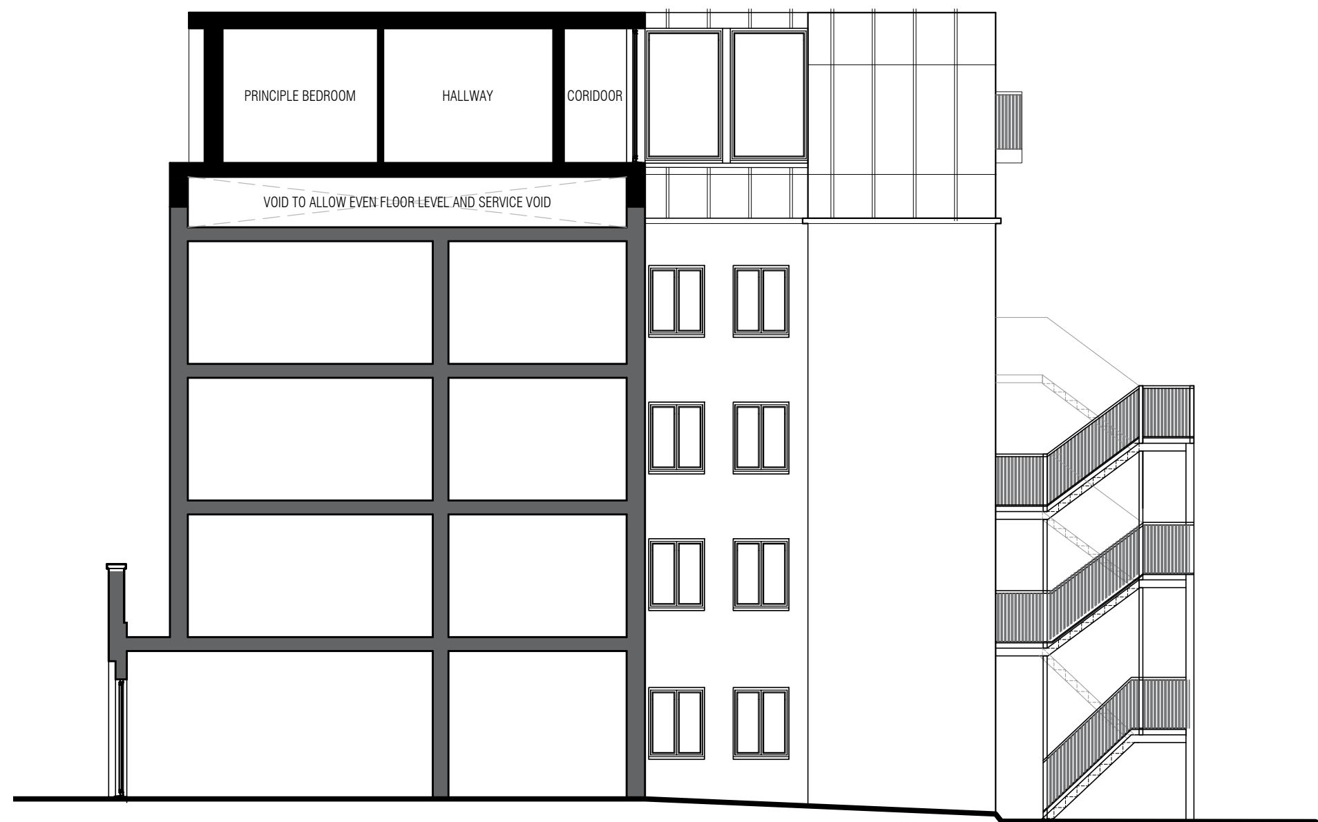
PROPOSED INTERNAL ELEVATION 01