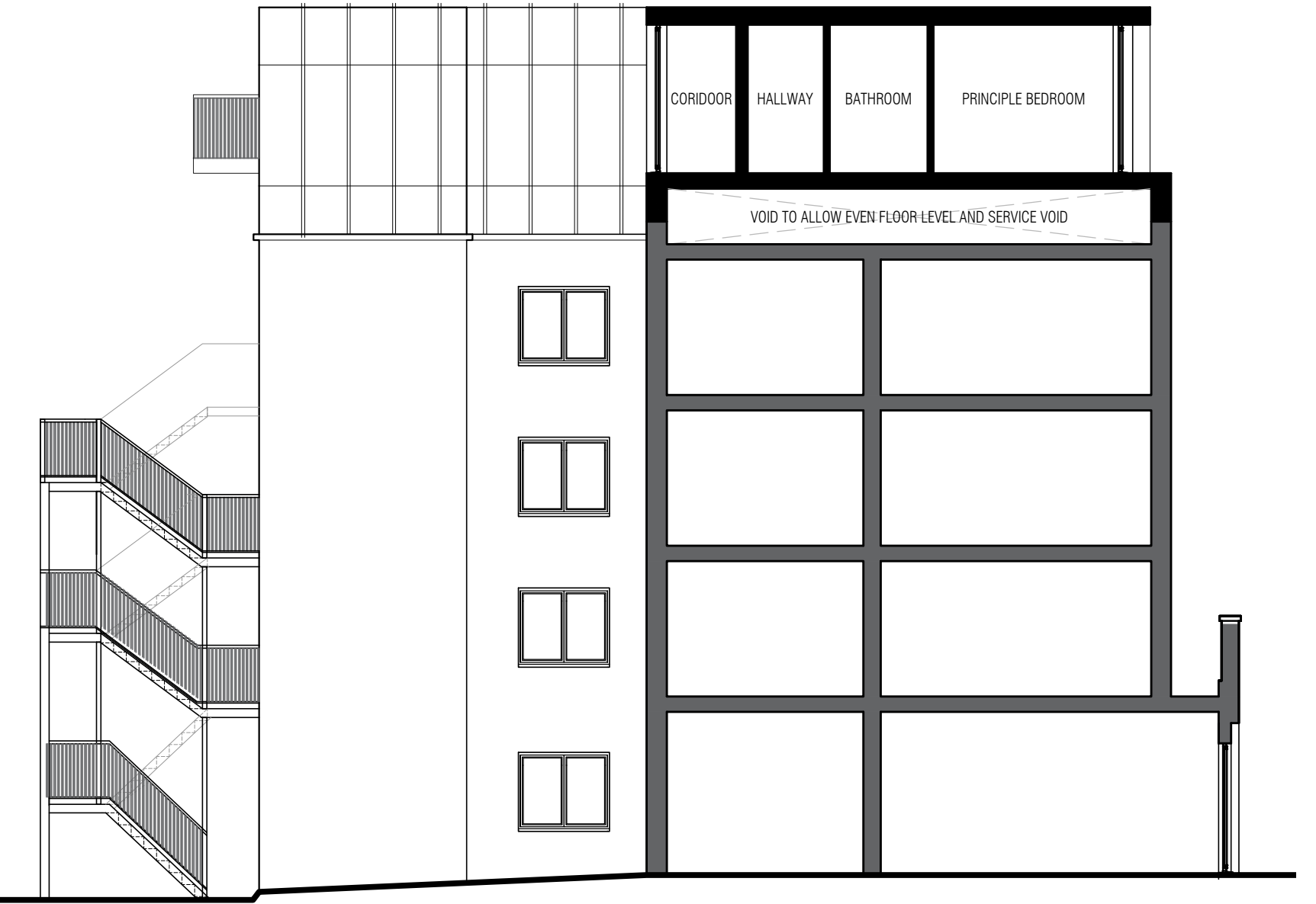
PROPOSED INTERNAL ELEVATION 04