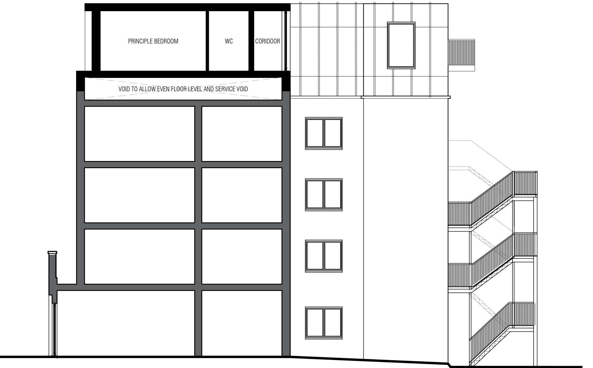
PROPOSED INTERNAL ELEVATION 05