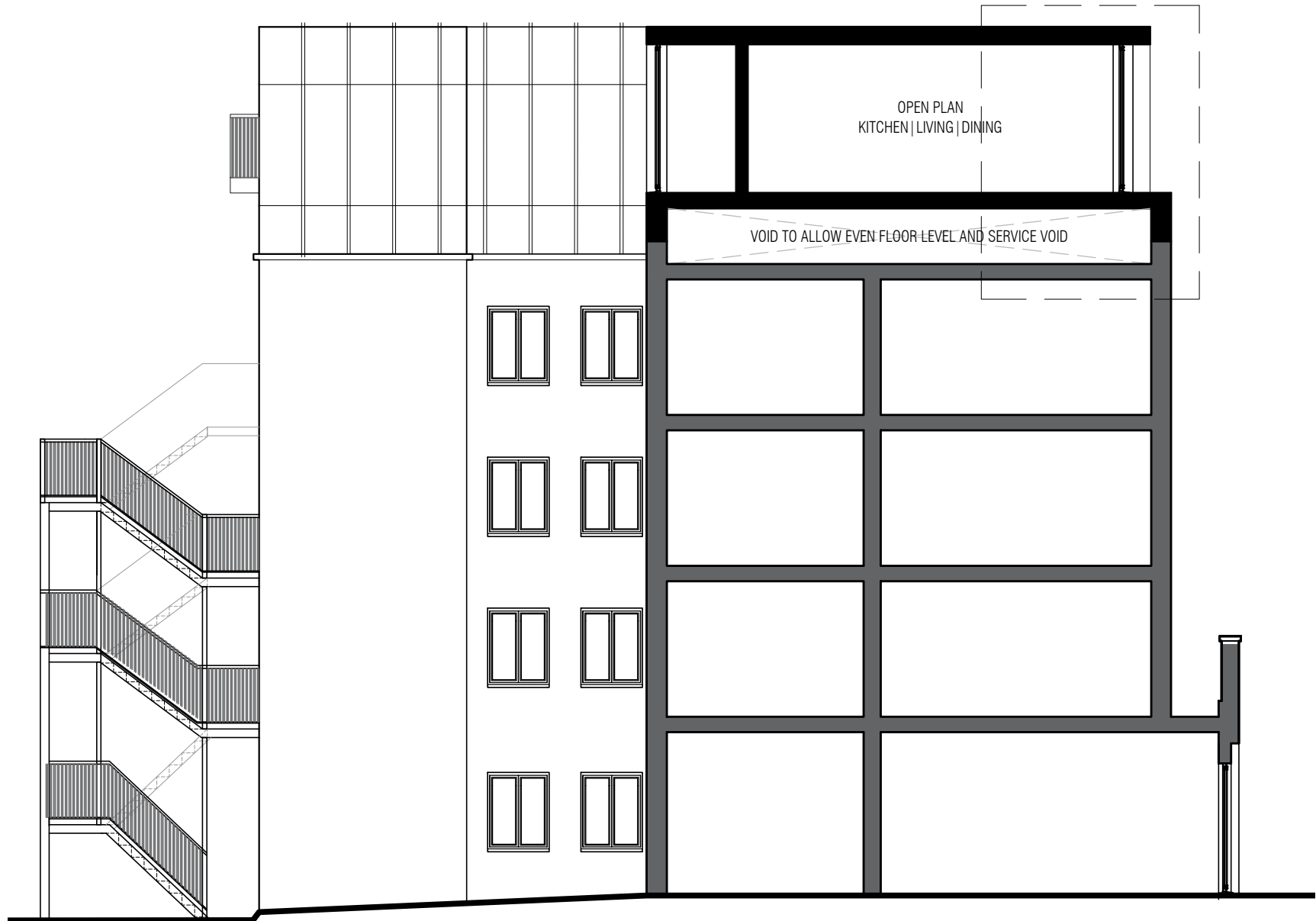
PROPOSED INTERNAL ELEVATION 02