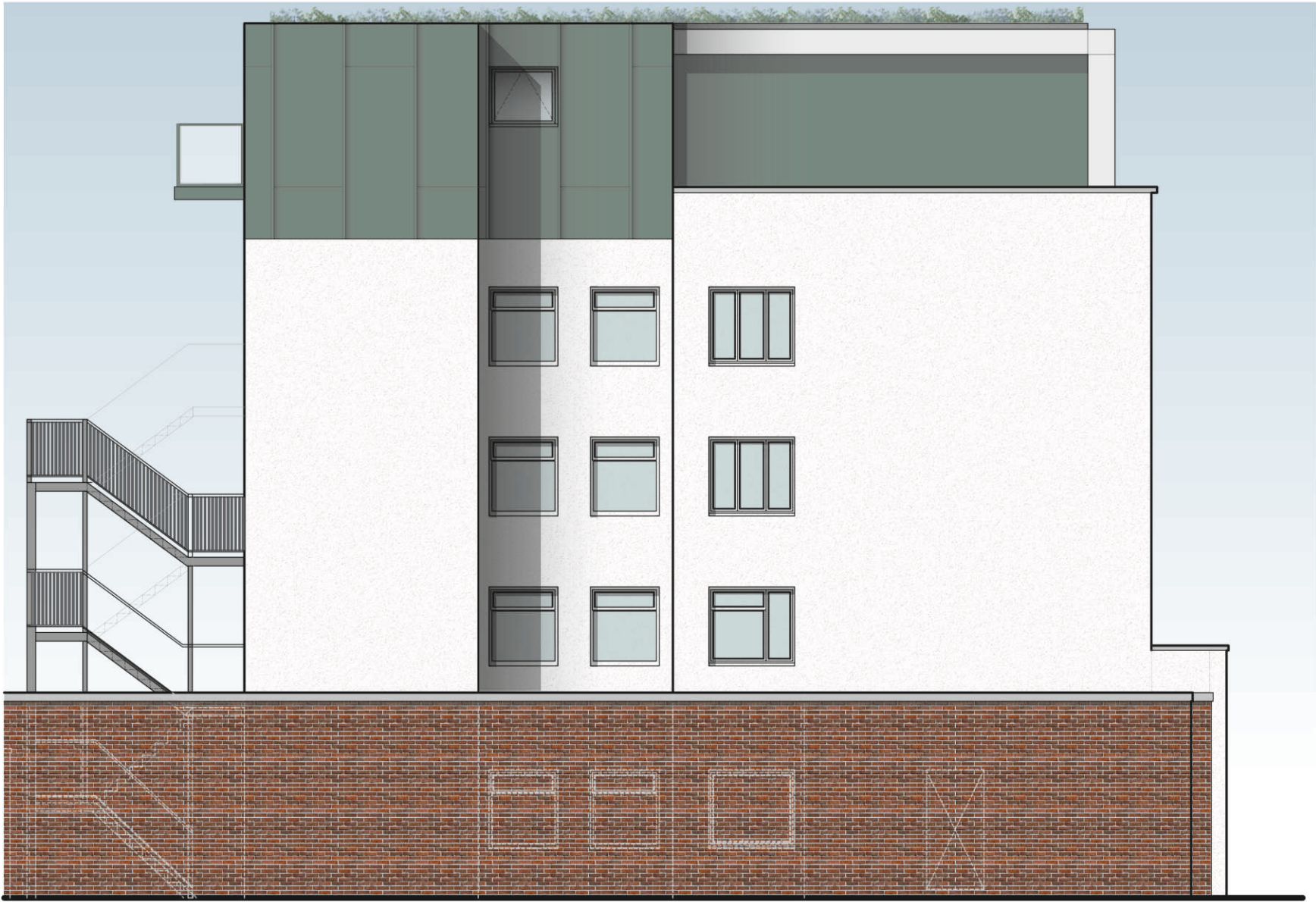
PROPOSED SIDE ELEVATION North-West - 1:100 @ A1