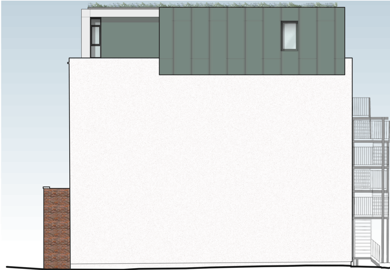
PROPOSED SIDE ELEVATION South-East - 1:100 @ A1