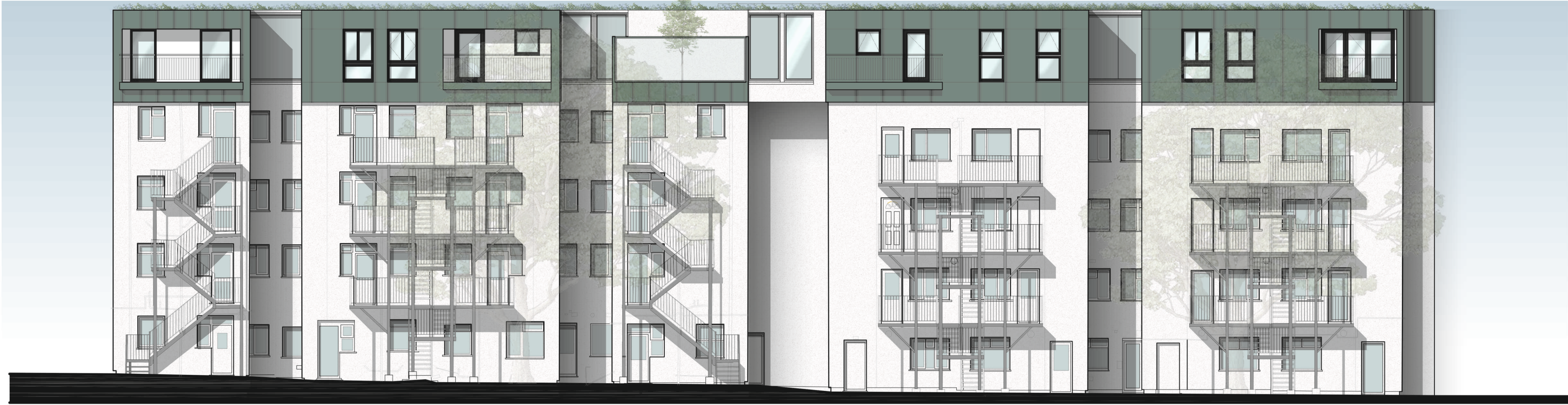
PROPOSED REAR ELEVATION North-East - 1:100 @ A1