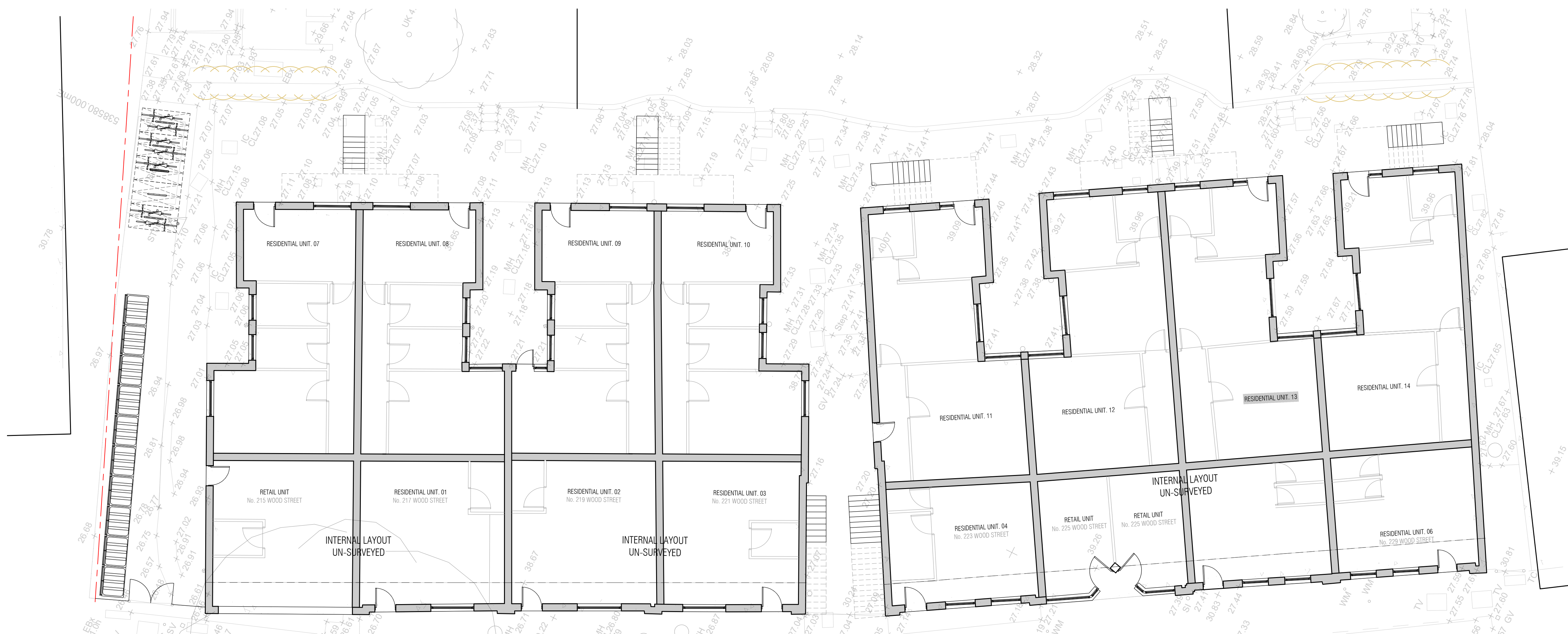
EXISTING GROUND FLOOR PLAN 1:100 @ A1