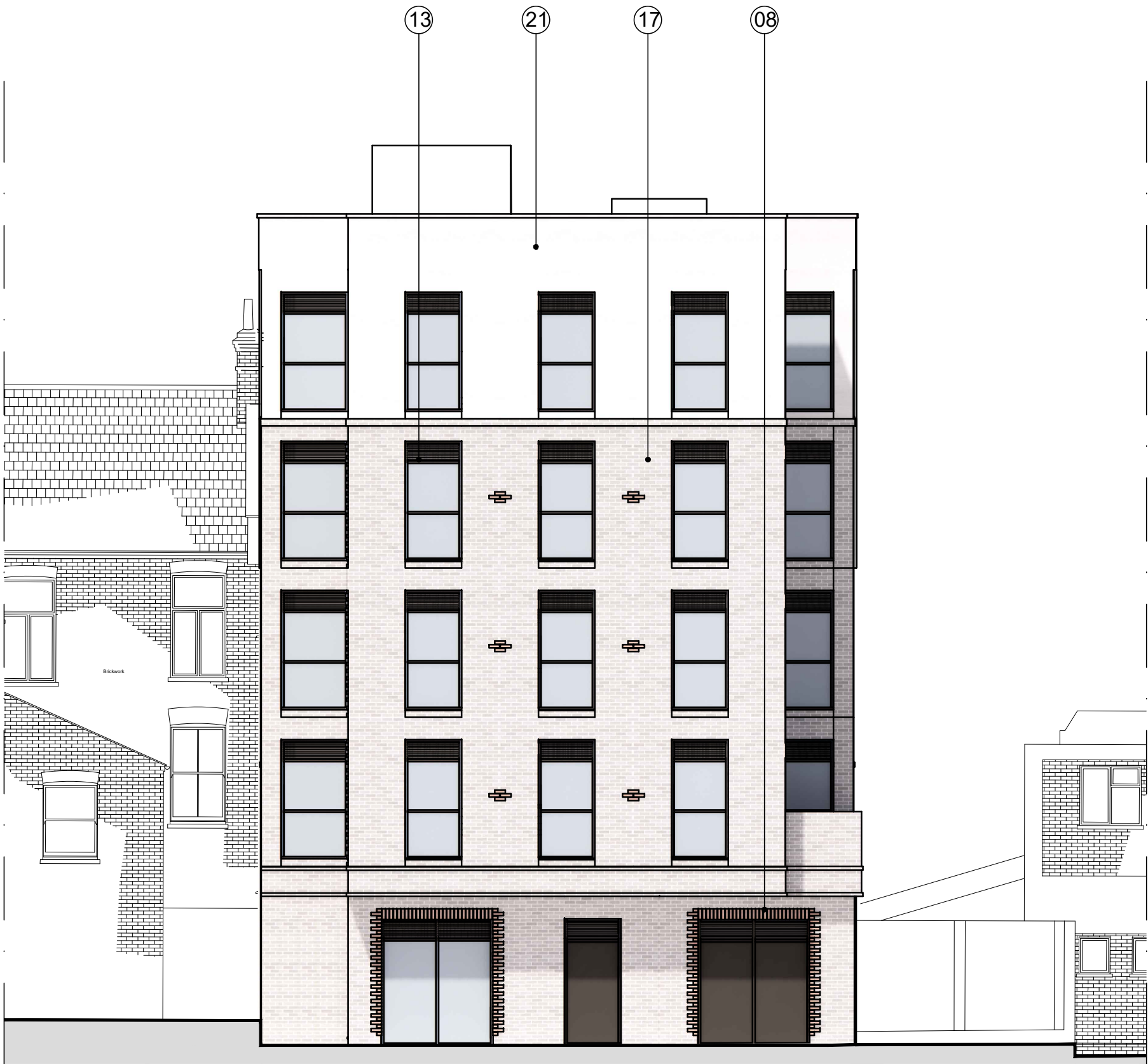
1 Block C - North East Elevation 1:50