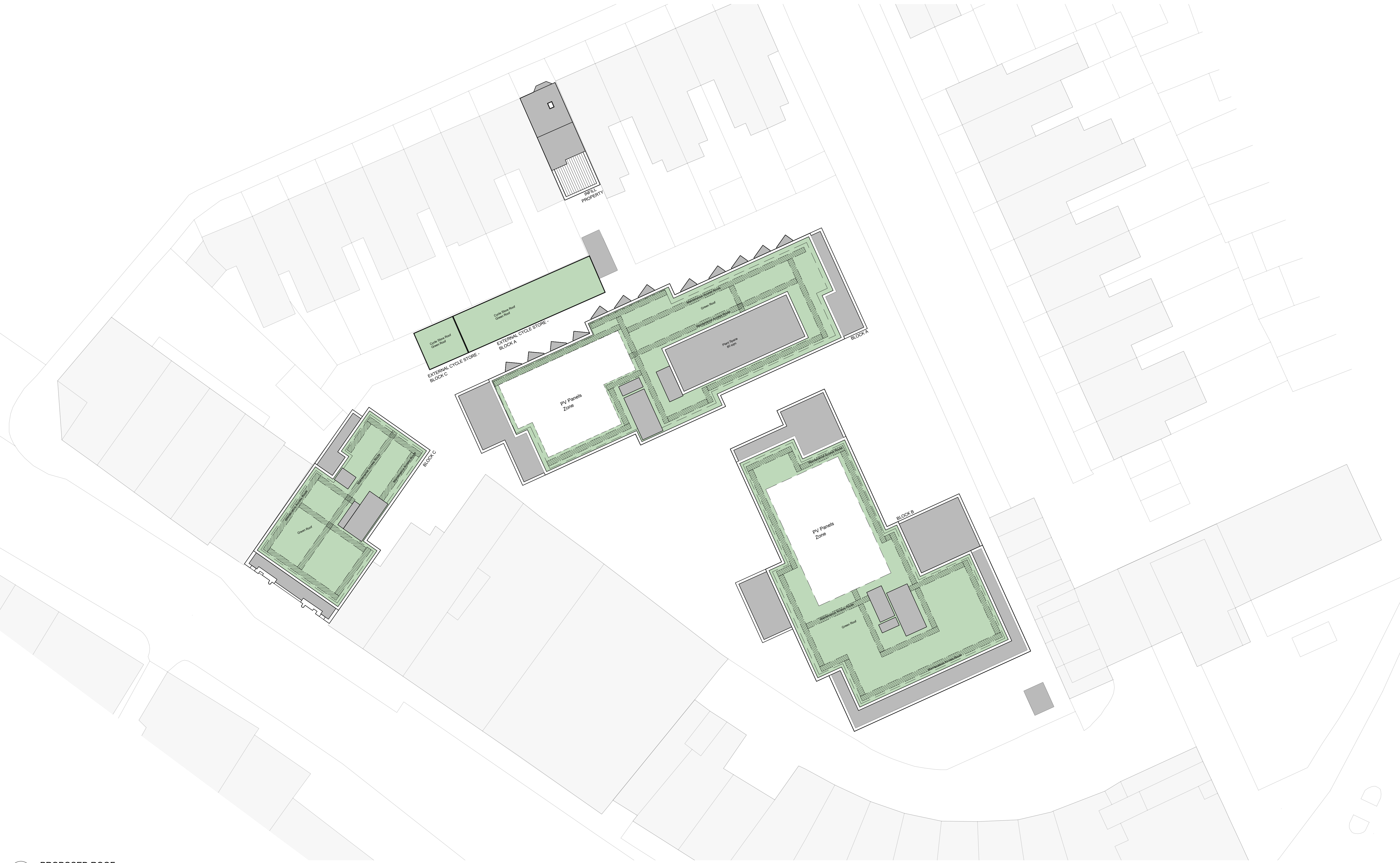
1 PROPOSED ROOF 1:200