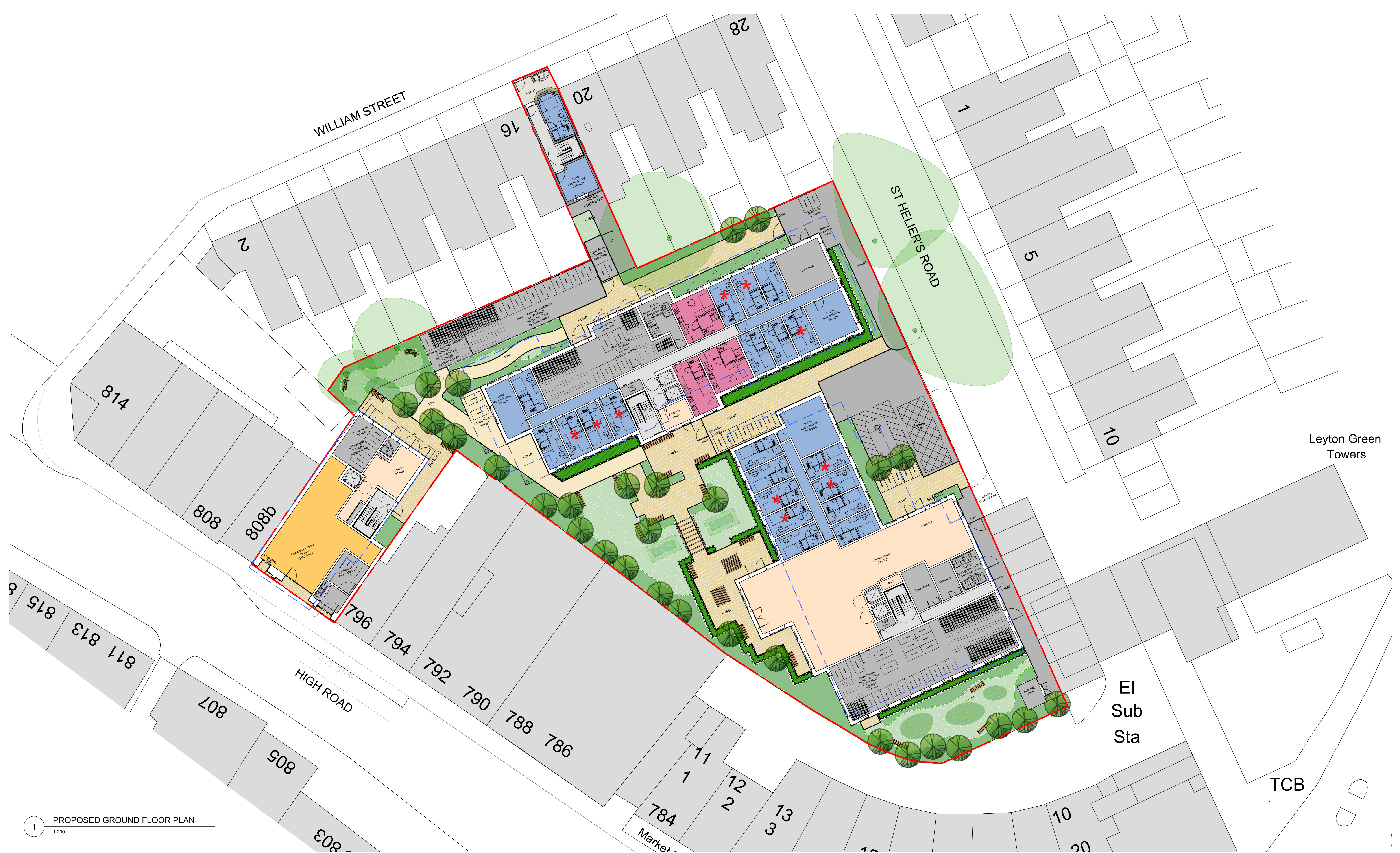
1 PROPOSED GROUND FLOOR PLAN 1:200