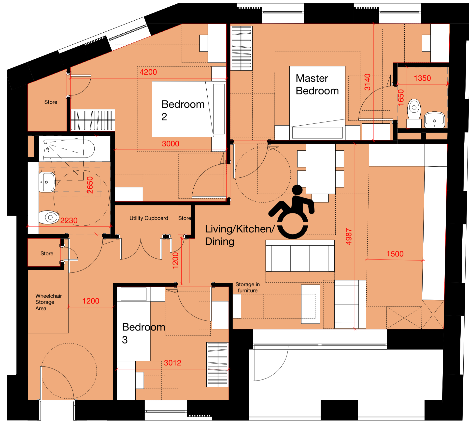
1 Terrace - 3B5P 1 : 50

*Wheelchair Homes Design Guidelines, South East London Housing Partnership **Volume 1 Dwellings, Approved Document M, Building Regulations ***London Housing Design Guide