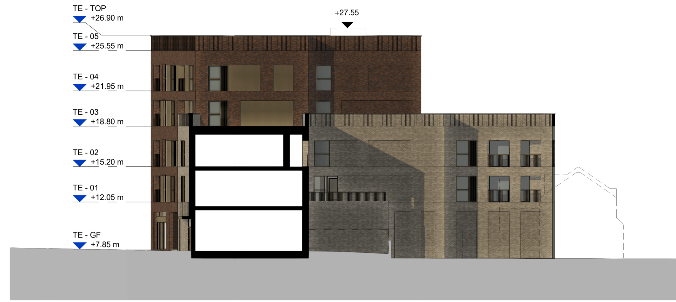
2 South Elevation B 1 : 200