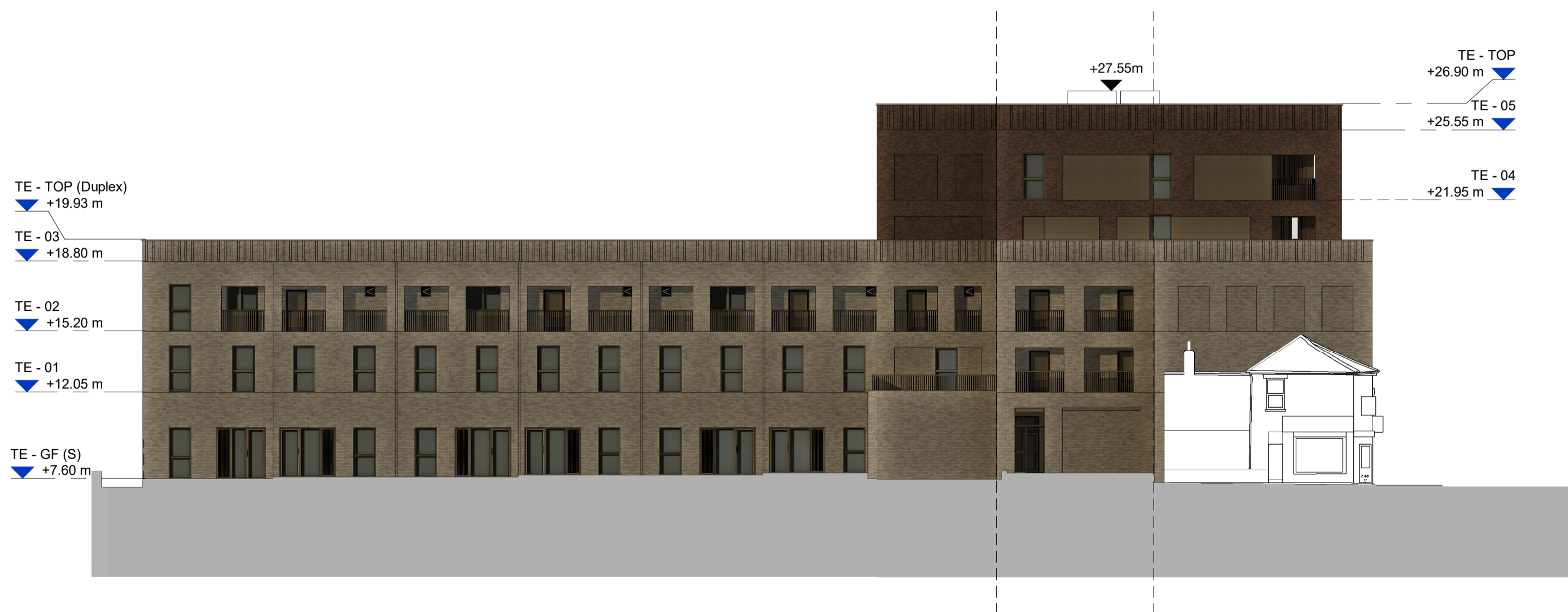
3 East Elevation 1 : 200