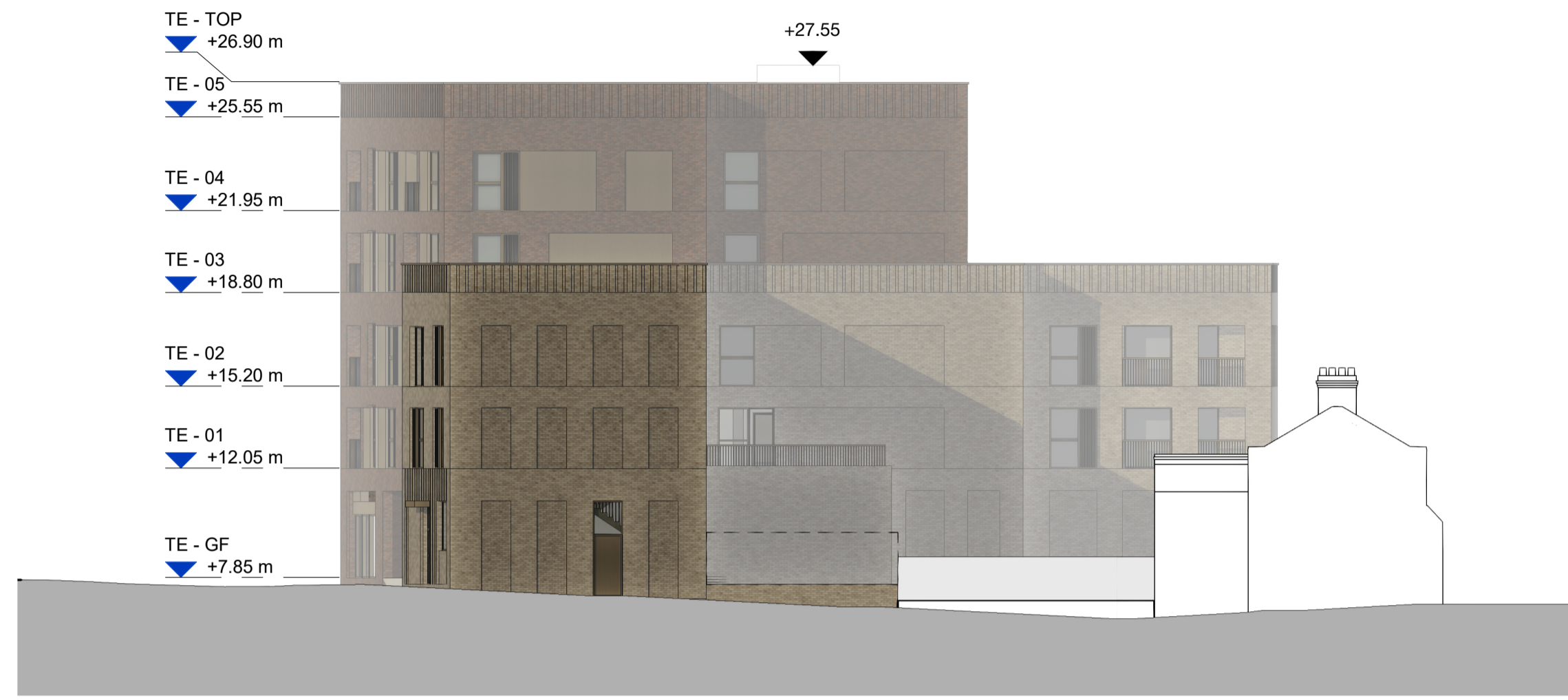
1 South Elevation A 1 : 200