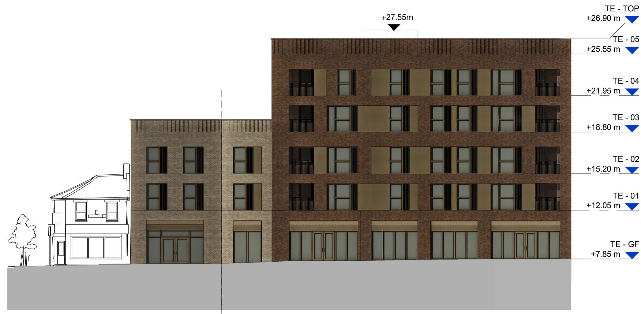
1 North Elevation 1 : 200