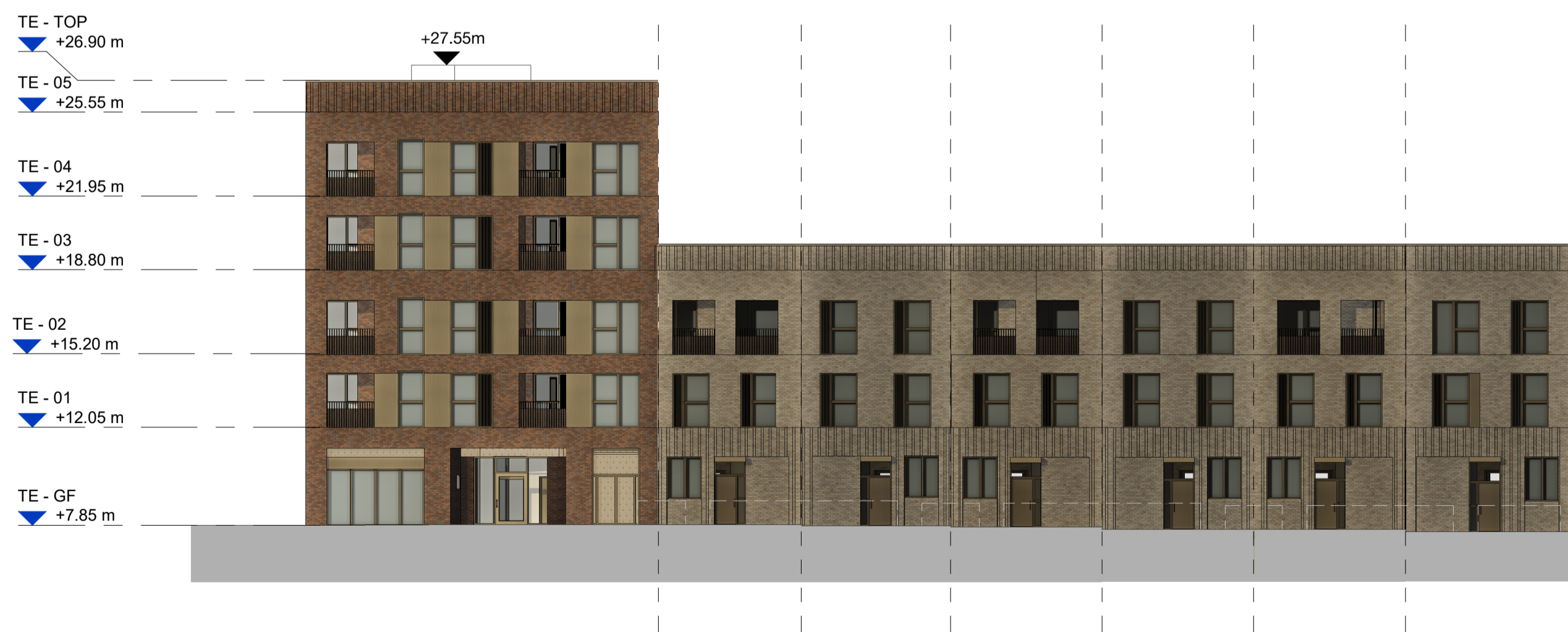
2 West Elevation 1 : 200