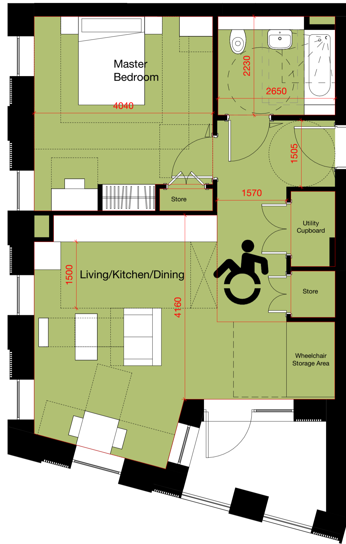
1 Tower 1 - 1B2P 1 : 50

*Wheelchair Homes Design Guidelines, South East London Housing Partnership **Volume 1 Dwellings, Approved Document M, Building Regulations ***London Housing Design Guide