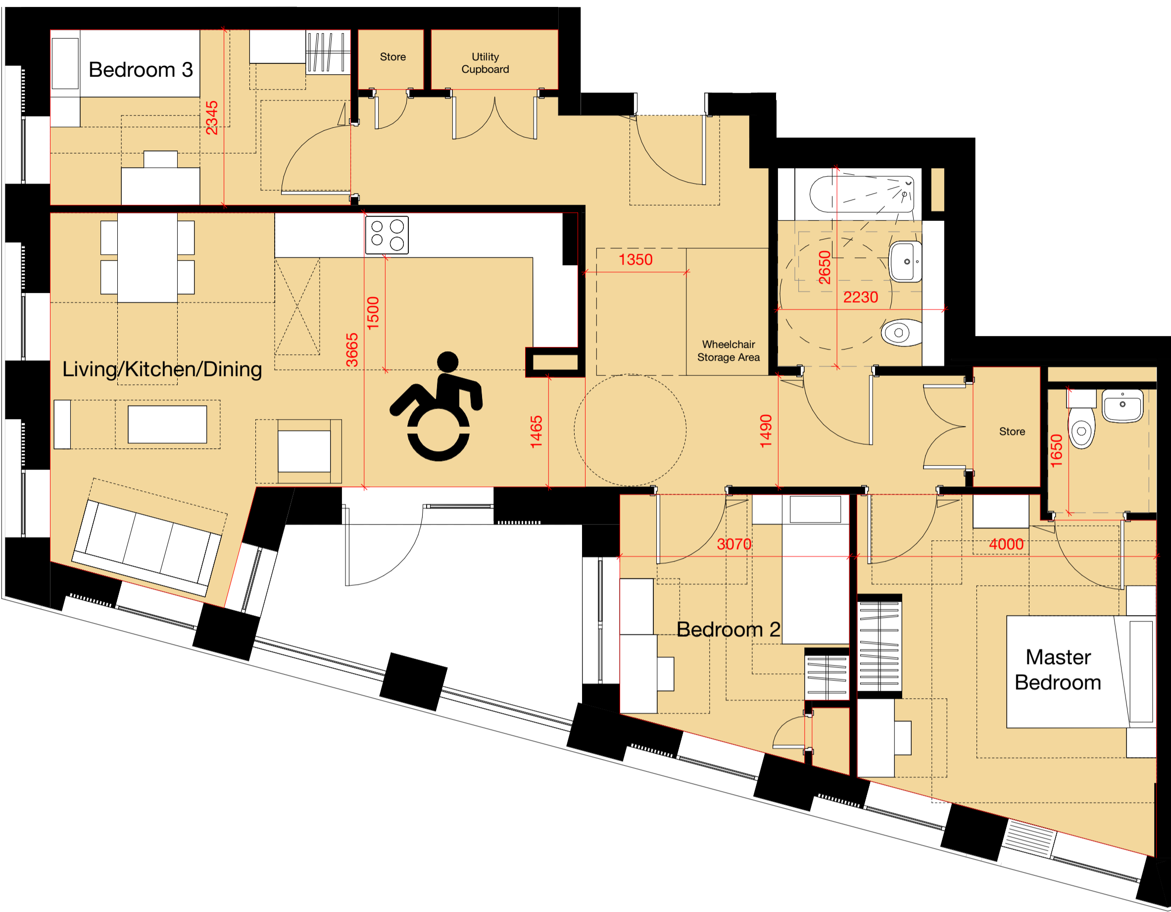
1 Tower 1 - 3B4P 1 : 50