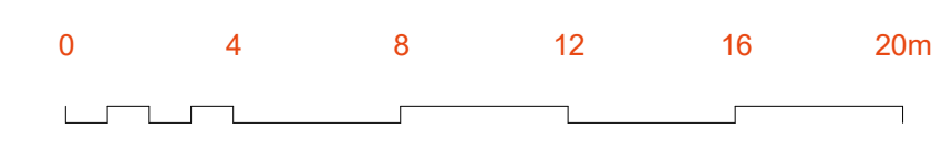
1 Site 3 - Proposed Roof Access Plan 1 : 200

Drawing No. LEABR-HBA-S3-26-DR-A-08-0226 Rev P2