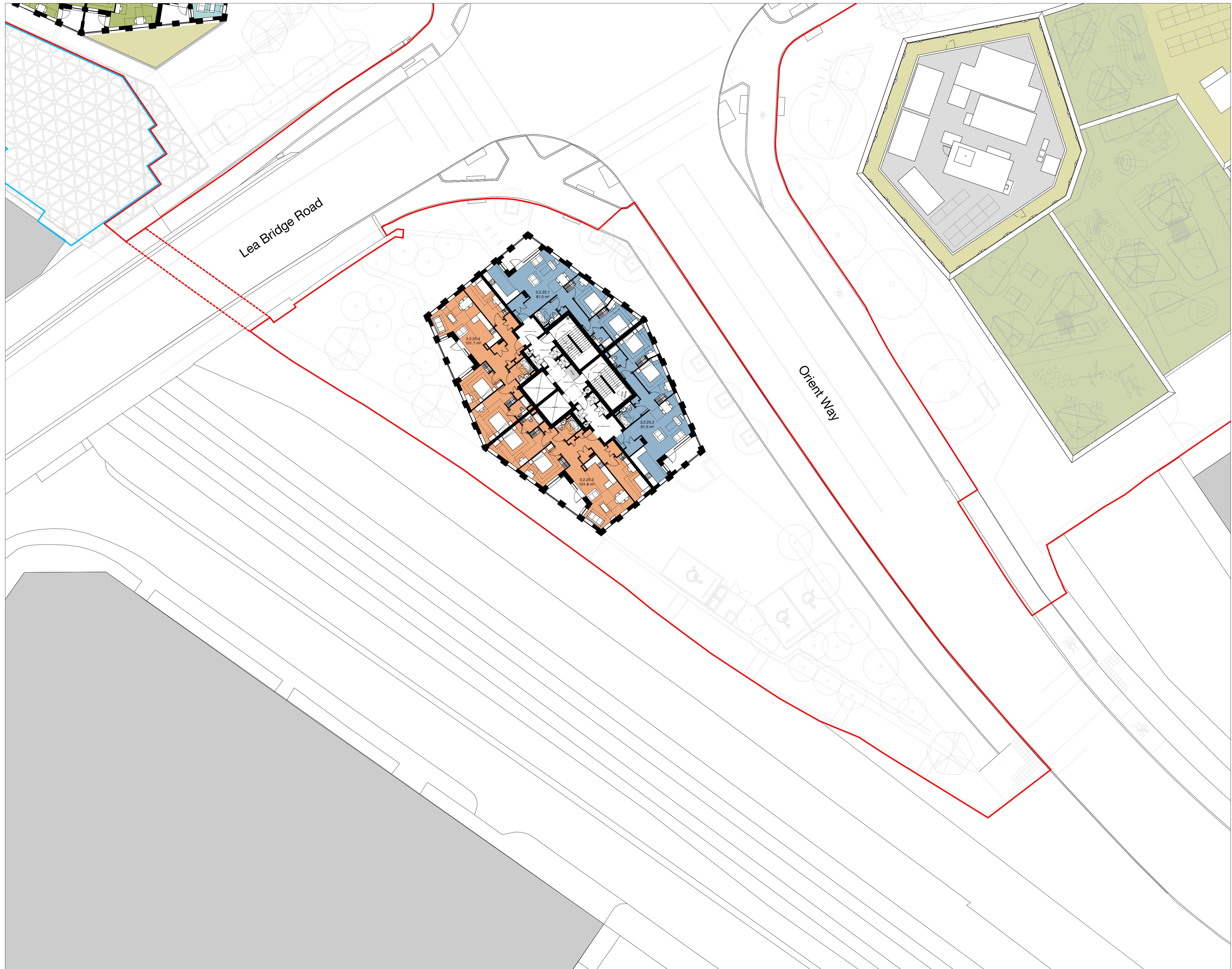
1 Site 3 - Proposed Twenty Fifth Floor Plan 1 : 200

Copyright Hawkins\Brown Architects No implied licence exists. This drawing should not be used to calculate areas for the purposes of valuation. Do not scale this drawing. All dimensions to be checked on the site by the contractor and such dimensions to be their responsibility. All work must comply with relevant British Standards and Building Regulations requirements. Drawing errors and omissions to be reported to the architect. To be read in conjunction with Architect's specification and other consultant information.