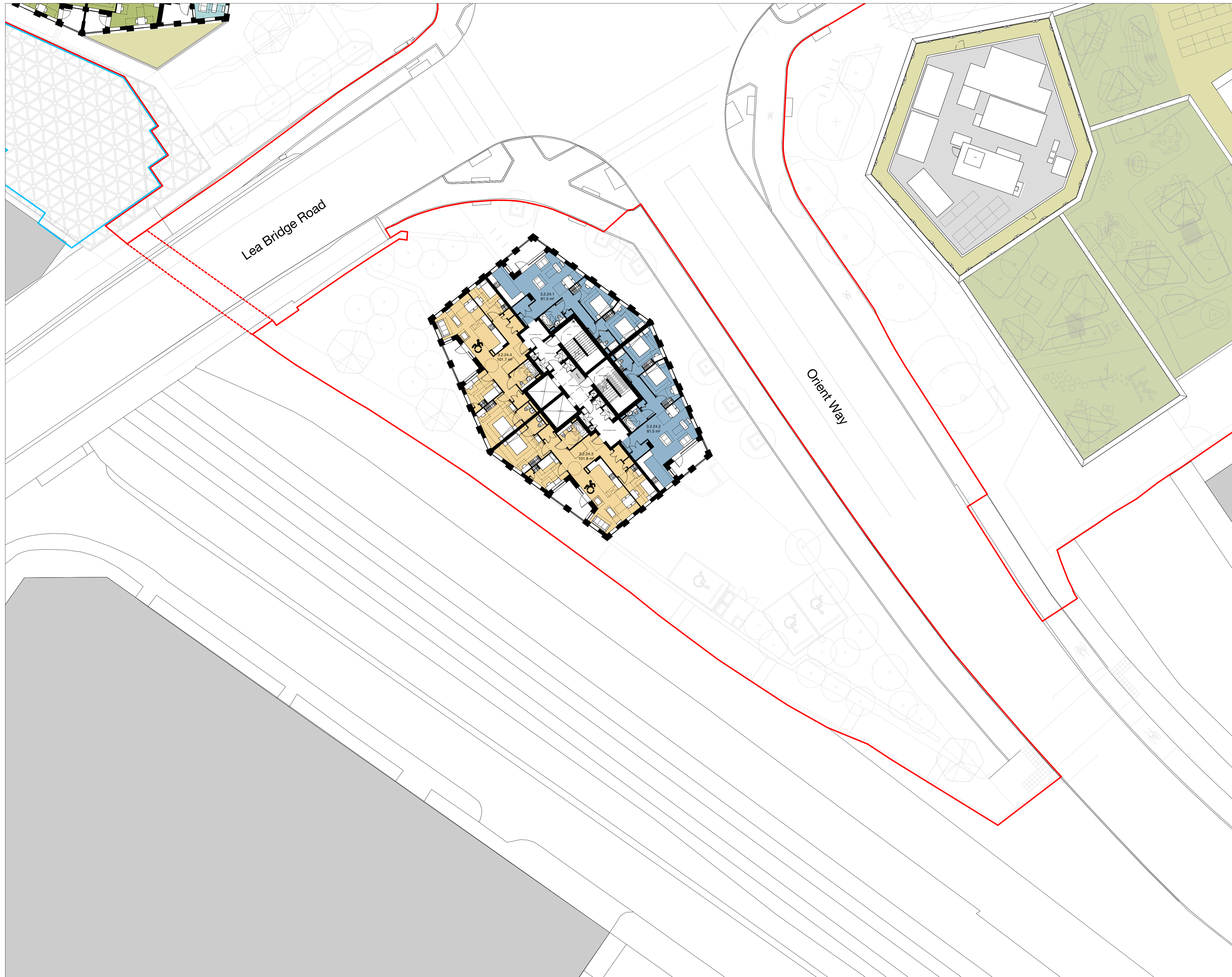
1 Site 3 - Proposed Twenty Fourth Floor Plan 1 : 200

Copyright Hawkins\Brown Architects No implied licence exists. This drawing should not be used to calculate areas for the purposes of valuation. Do not scale this drawing. All dimensions to be checked on the site by the contractor and such dimensions to be their responsibility. All work must comply with relevant British Standards and Building Regulations requirements. Drawing errors and omissions to be reported to the architect. To be read in conjunction with Architect's specification and other consultant information.