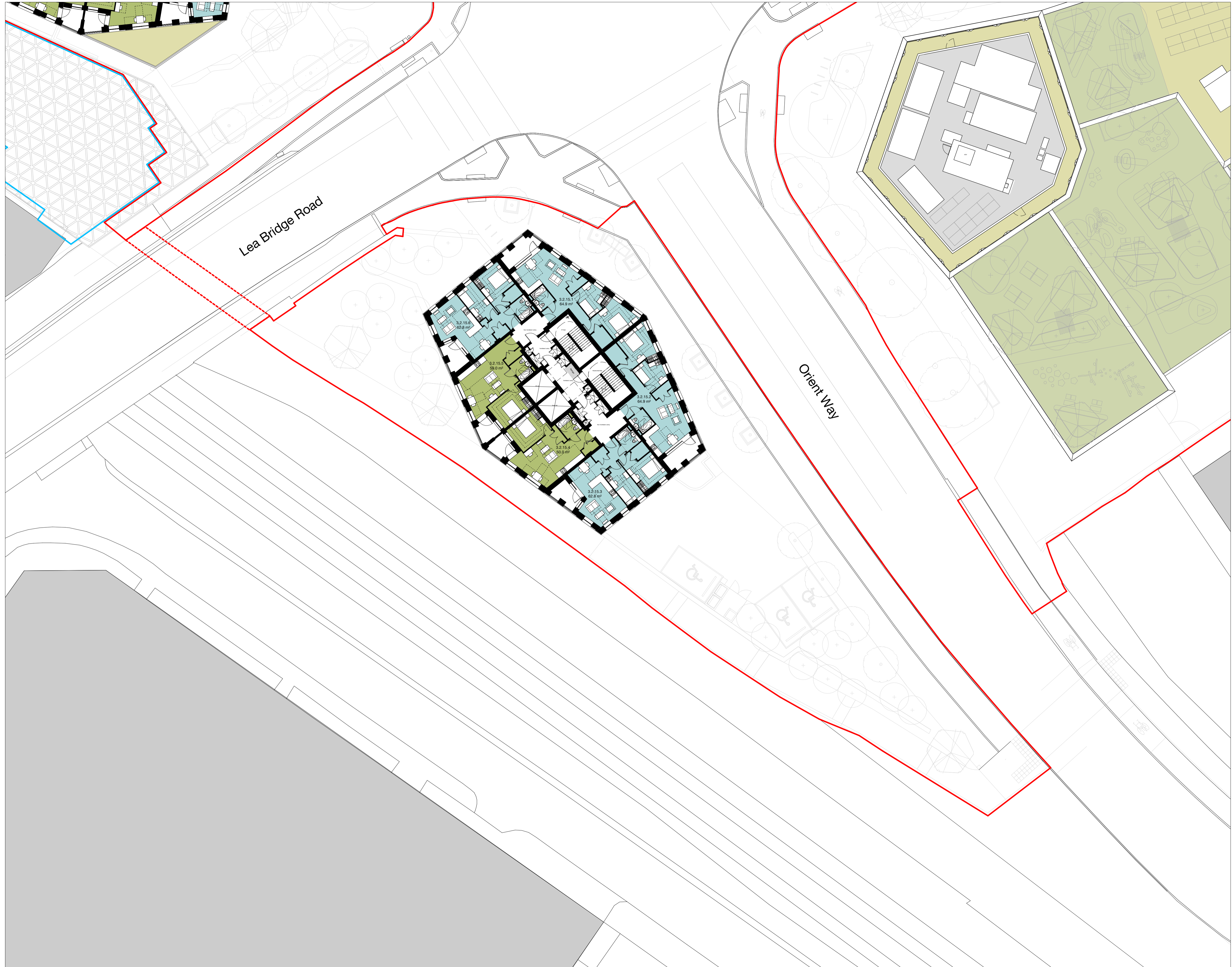
1 Site 3 - Proposed Fifteenth Floor Plan 1 : 200

Copyright Hawkins\Brown Architects No implied licence exists. This drawing should not be used to calculate areas for the purposes of valuation. Do not scale this drawing. All dimensions to be checked on the site by the contractor and such dimensions to be their responsibility. All work must comply with relevant British Standards and Building Regulations requirements. Drawing errors and omissions to be reported to the architect. To be read in conjunction with Architect's specification and other consultant information.