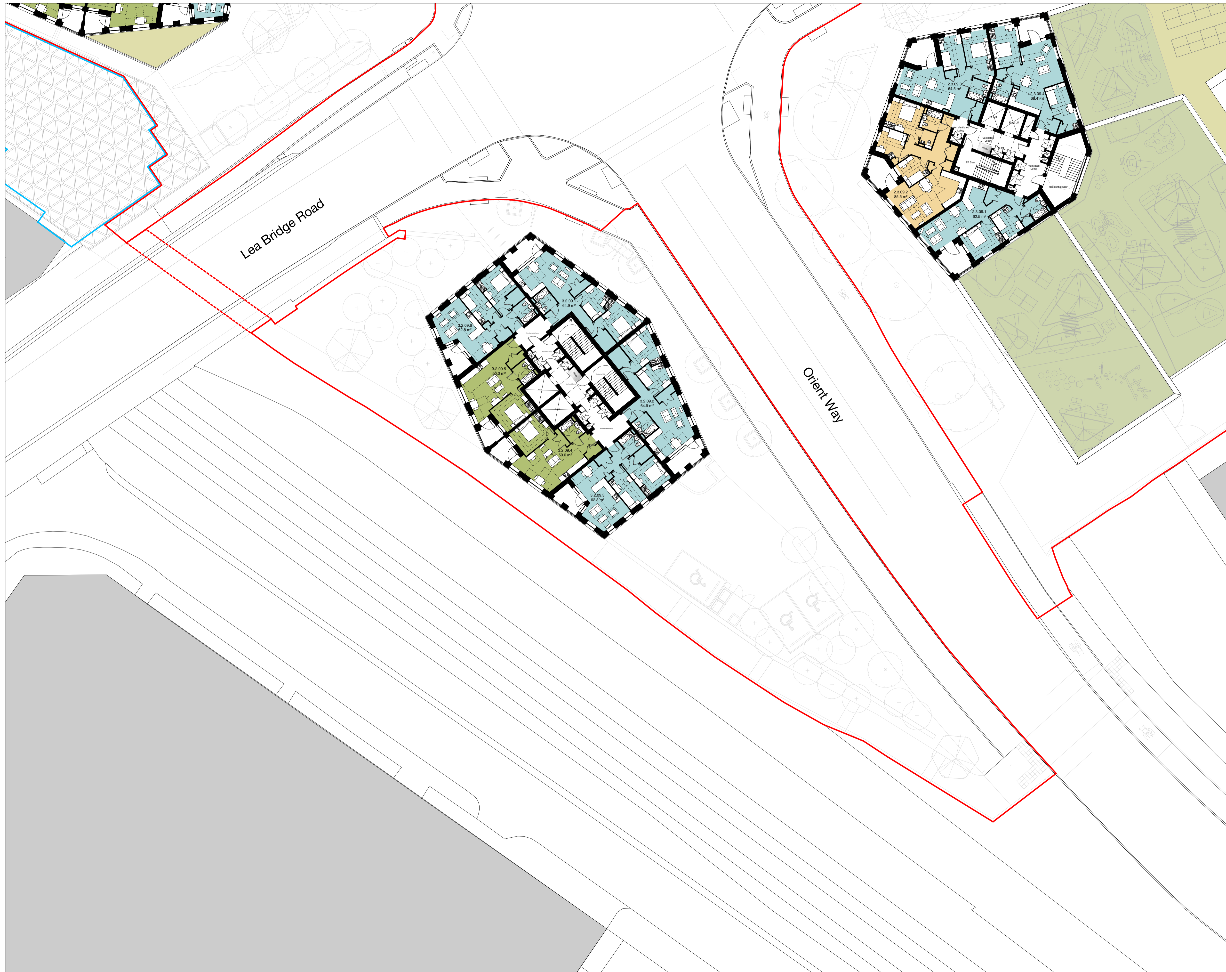
1 Site 3 - Proposed Ninth Floor Plan 1 : 200

Copyright Hawkins\Brown Architects No implied licence exists. This drawing should not be used to calculate areas for the purposes of valuation. Do not scale this drawing. All dimensions to be checked on the site by the contractor and such dimensions to be their responsibility. All work must comply with relevant British Standards and Building Regulations requirements. Drawing errors and omissions to be reported to the architect. To be read in conjunction with Architect's specification and other consultant information.