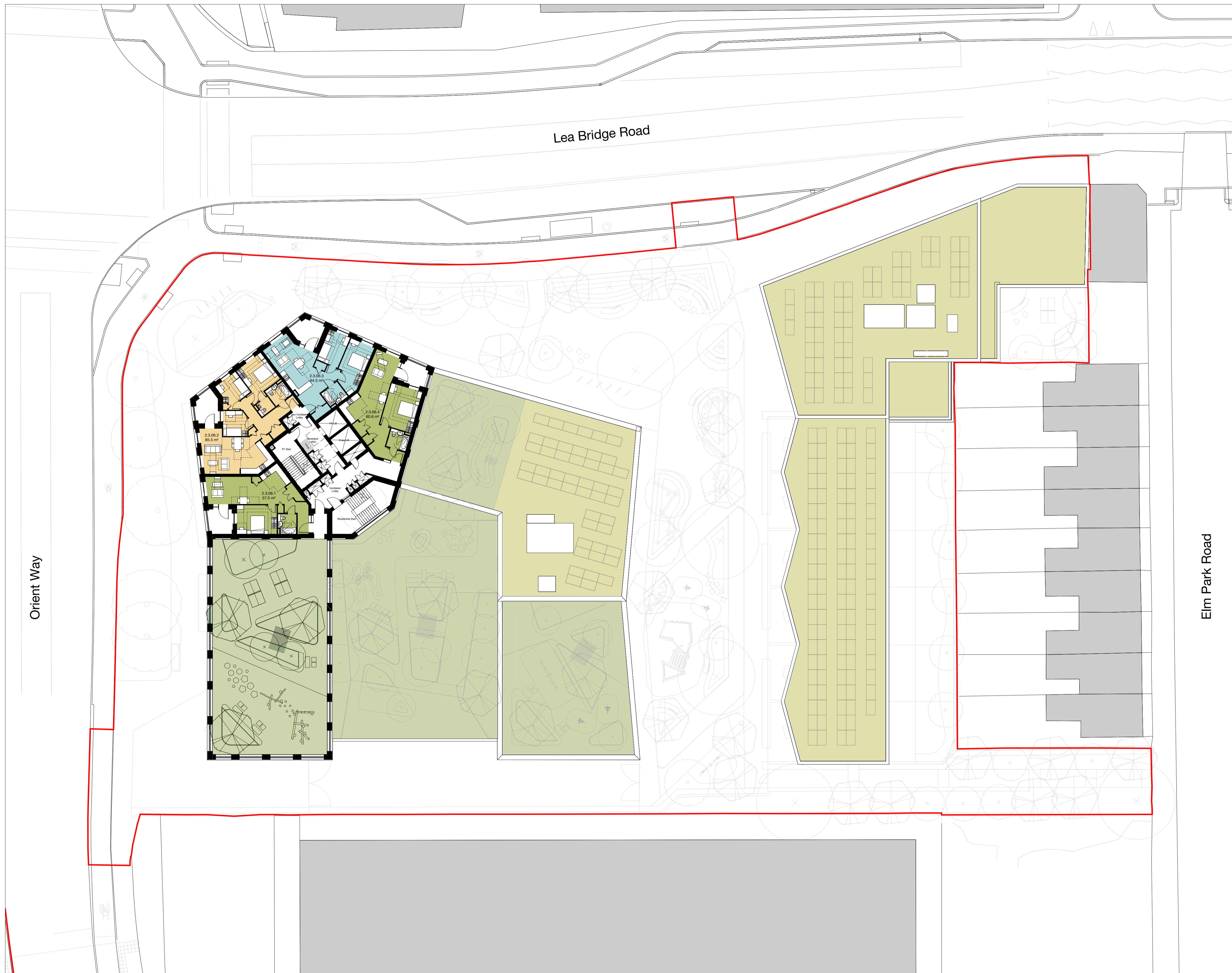
1 Site 2 - Proposed Sixth Floor Plan 1 : 200

Drawing No. LEABR-HBA-S2-06-DR-A-08-0186 Rev P6