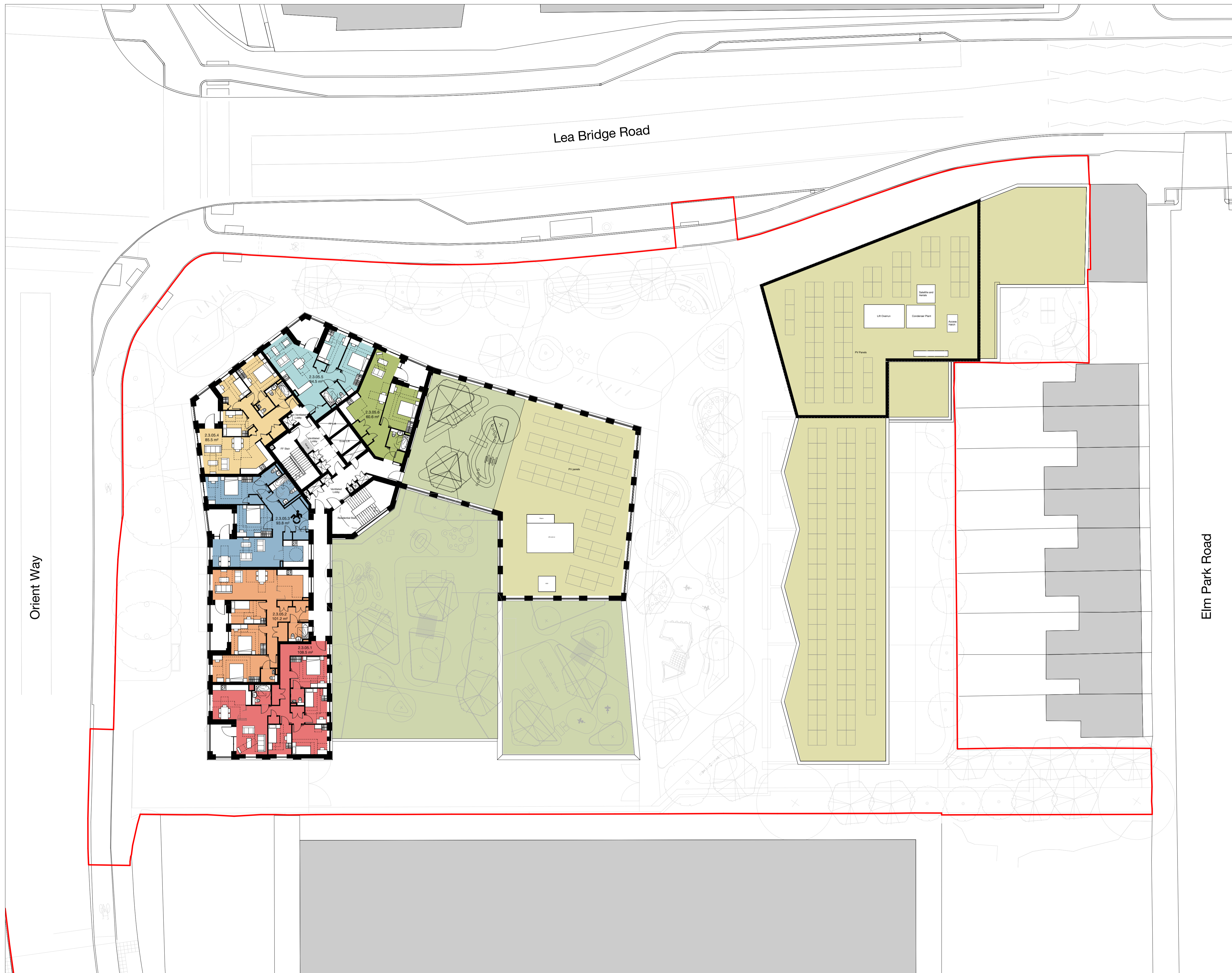
1 Site 2 - Proposed Fifth Floor Plan 1 : 200

Drawing No. LEABR-HBA-S2-05-DR-A-08-0185 Rev P6