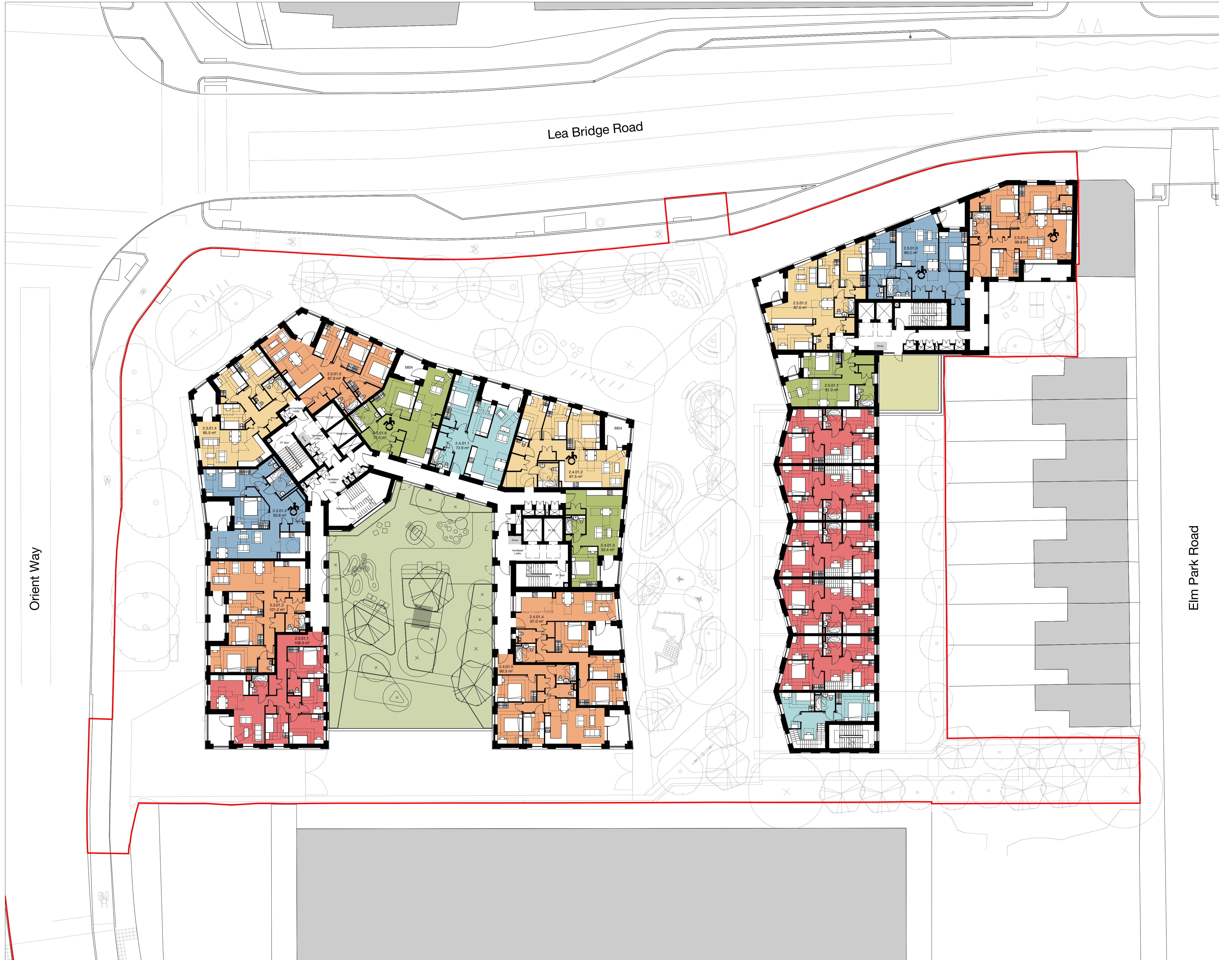
1 Site 2 - Proposed First Floor Plan 1 : 200

Drawing No. LEABR-HBA-S2-01-DR-A-08-0181 Rev P6