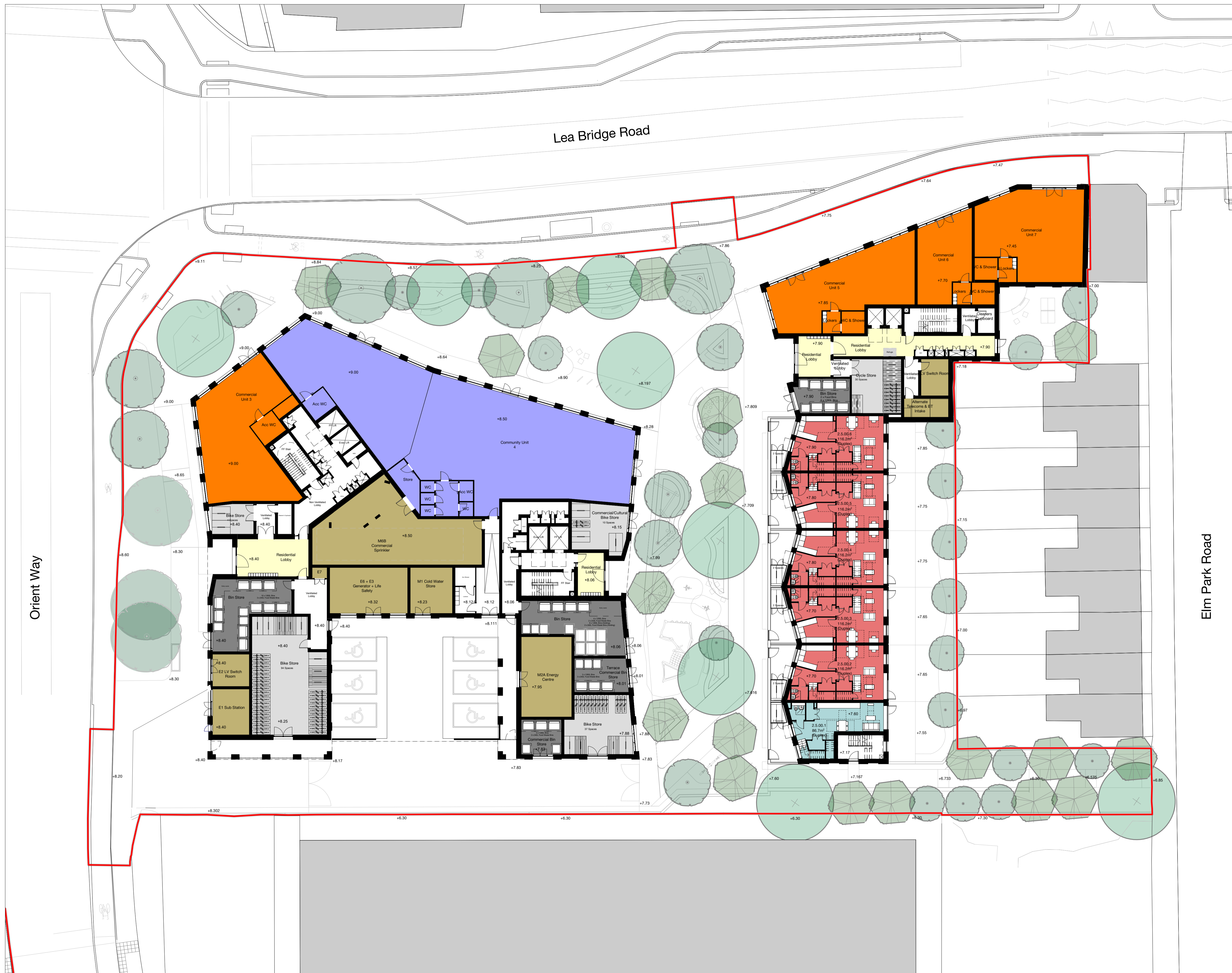
1 Site 2 - Proposed Ground Floor Plan 1 : 200

Drawing No. LEABR-HBA-S2-00-DR-A-08-0180 Rev P7