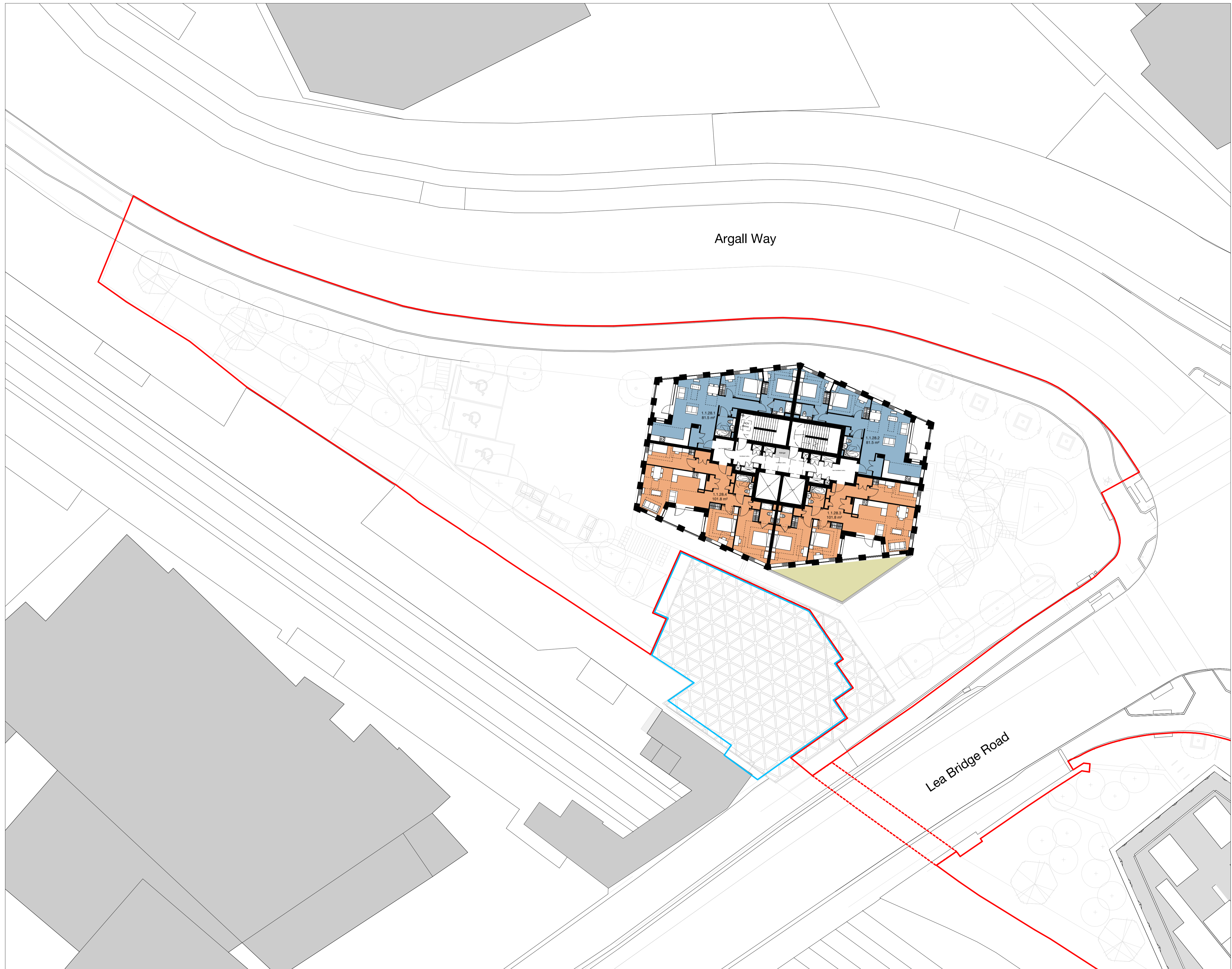
1 Site 1 - Proposed Twenty Eighth Floor Plan 1 : 200

Drawing No. LEABR-HBA-S1-28-DR-A-08-0178 Rev P2