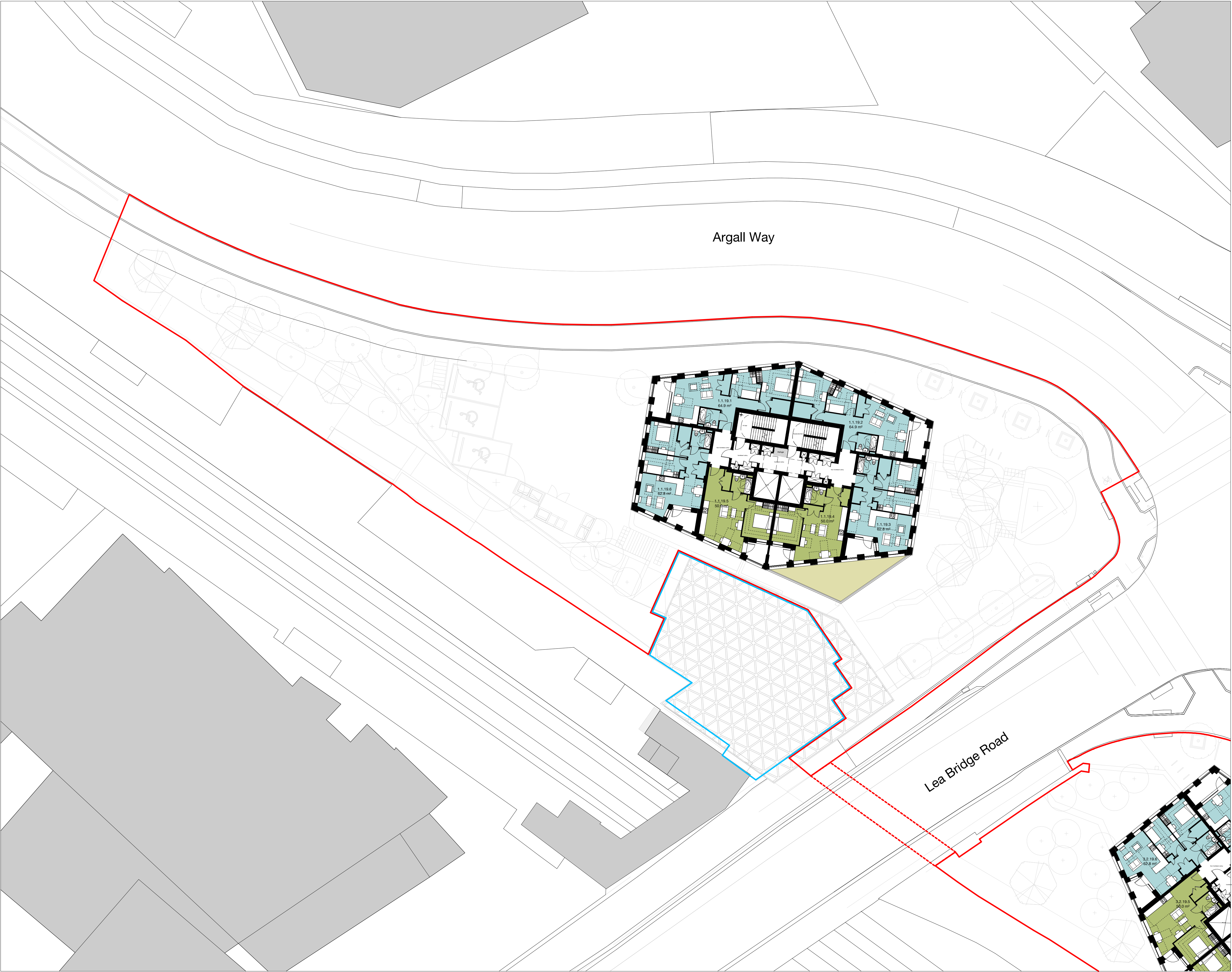
1 Site 1 - Proposed Nineteenth Floor Plan 1 : 200