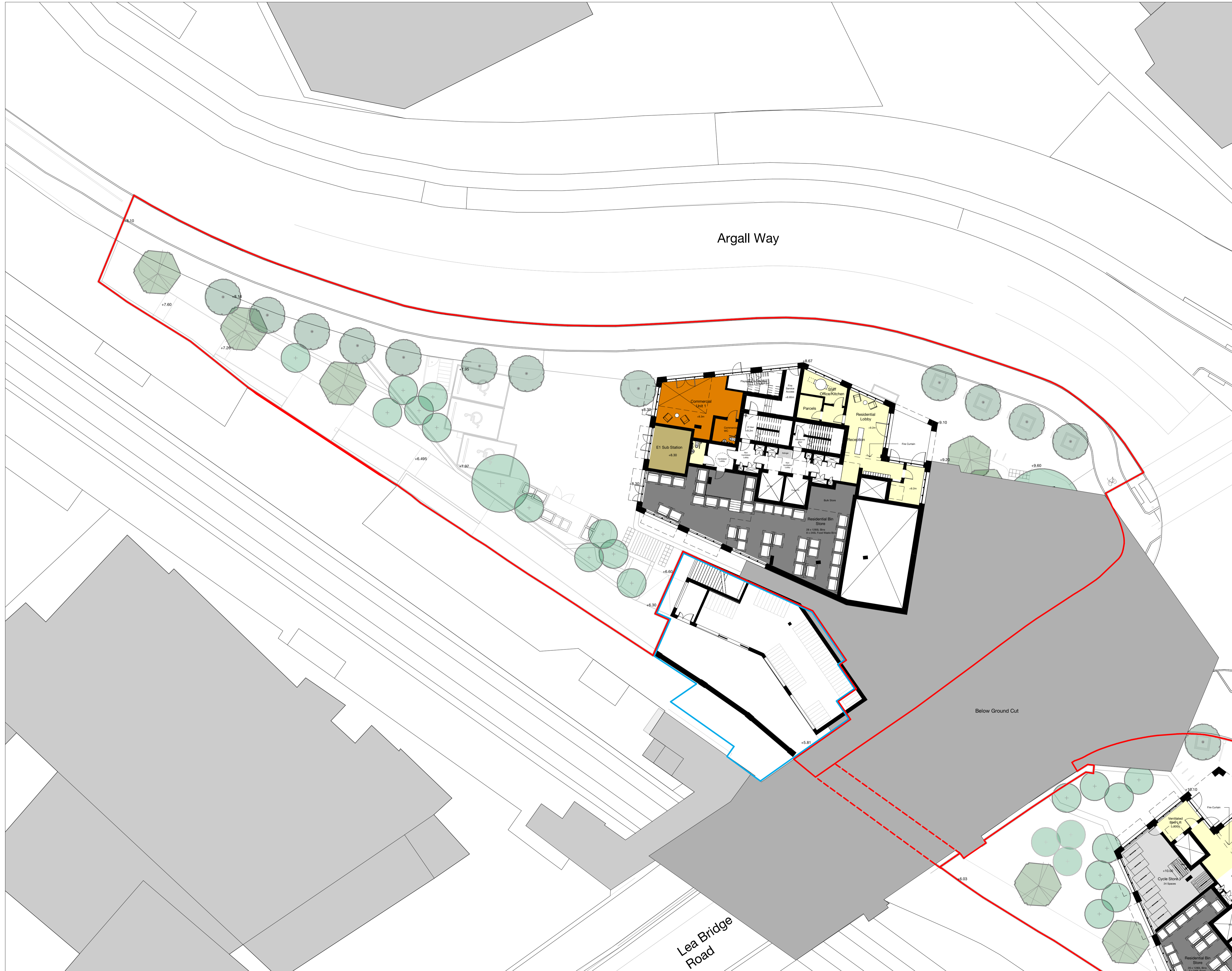
1 Site 1 - Proposed Ground Floor Plan 1 : 200