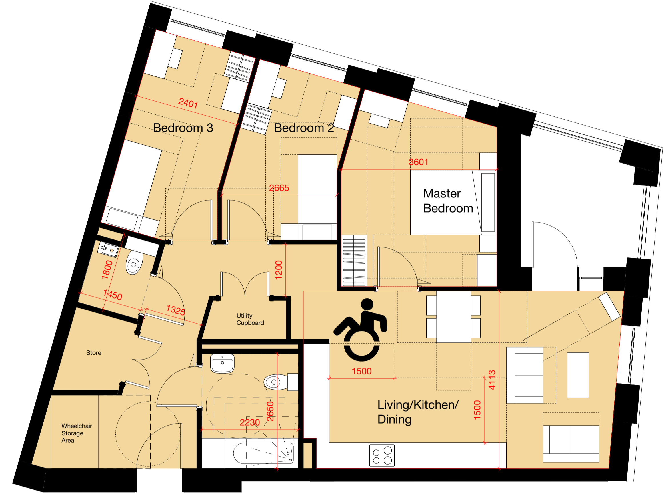
1 Courtyard - 3B4P 1:50

*Wheelchair Homes Design Guidelines, South East London Housing Partnership **Volume 1 Dwellings, Approved Document M, Building Regulations ***London Housing Design Guide