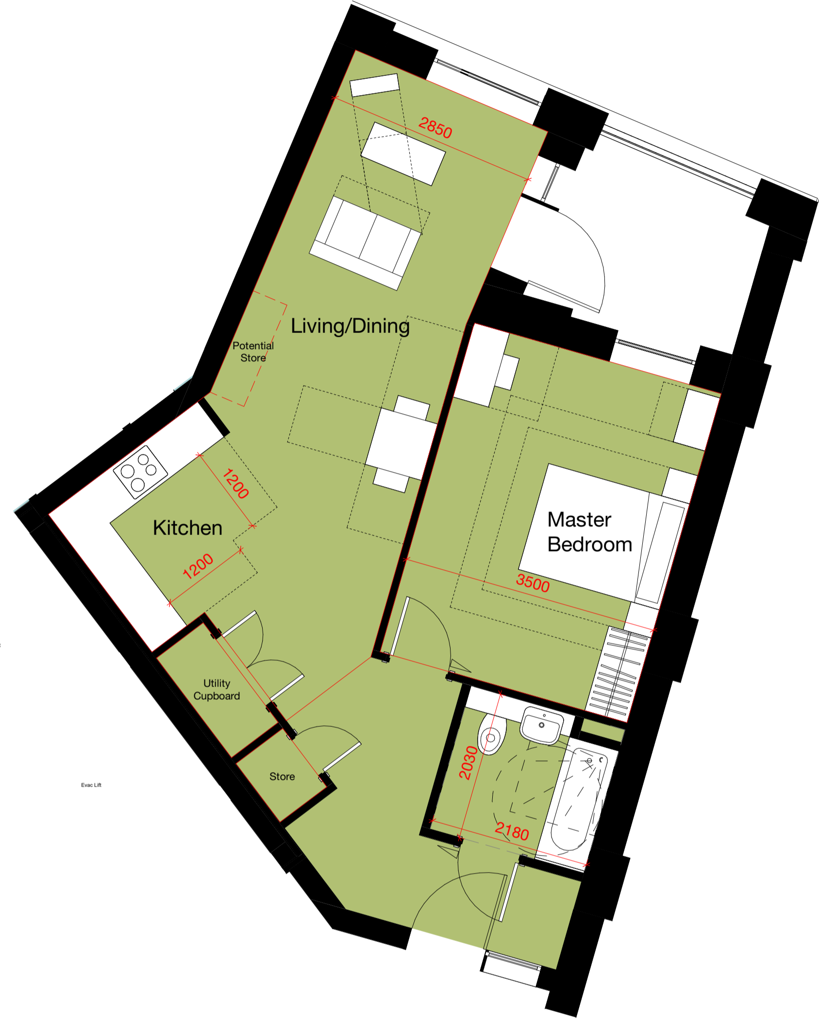
1 Courtyard - 1B2P 1 : 50