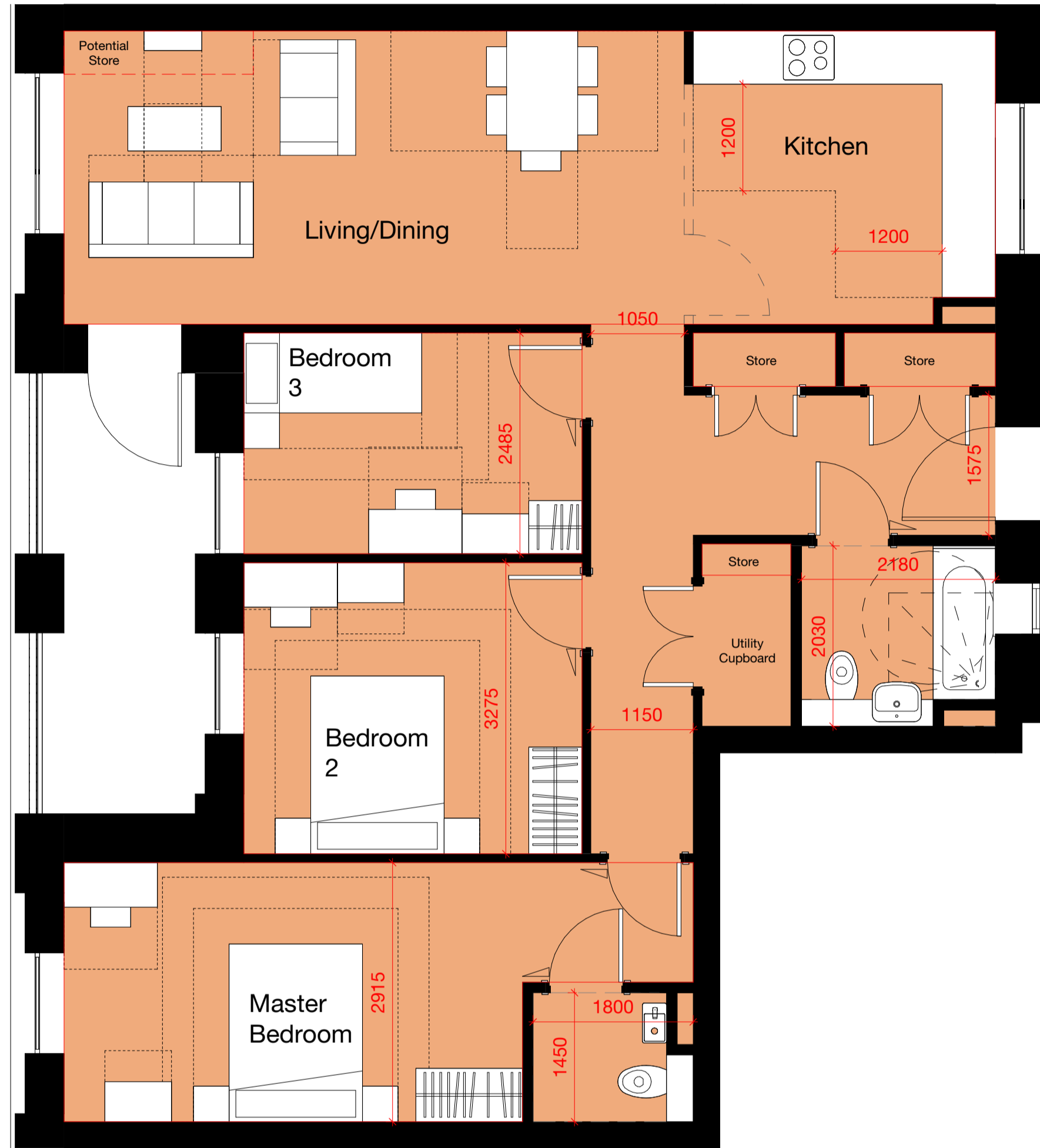
1 Courtyard - 3B5P 1 : 50