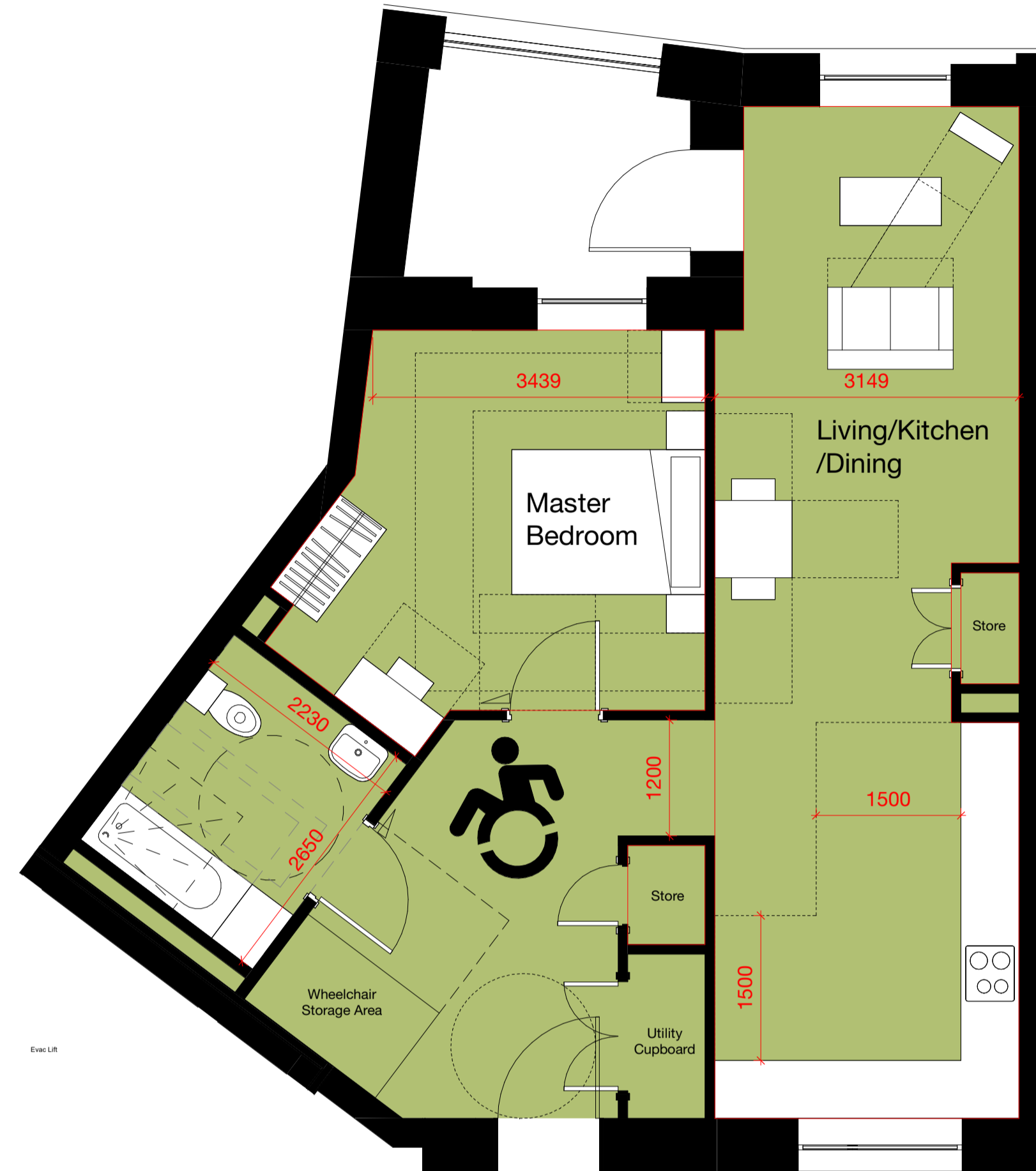
1 Courtyard - 1B2P 1:50

*Wheelchair Homes Design Guidelines, South East London Housing Partnership **Volume 1 Dwellings, Approved Document M, Building Regulations ***London Housing Design Guide