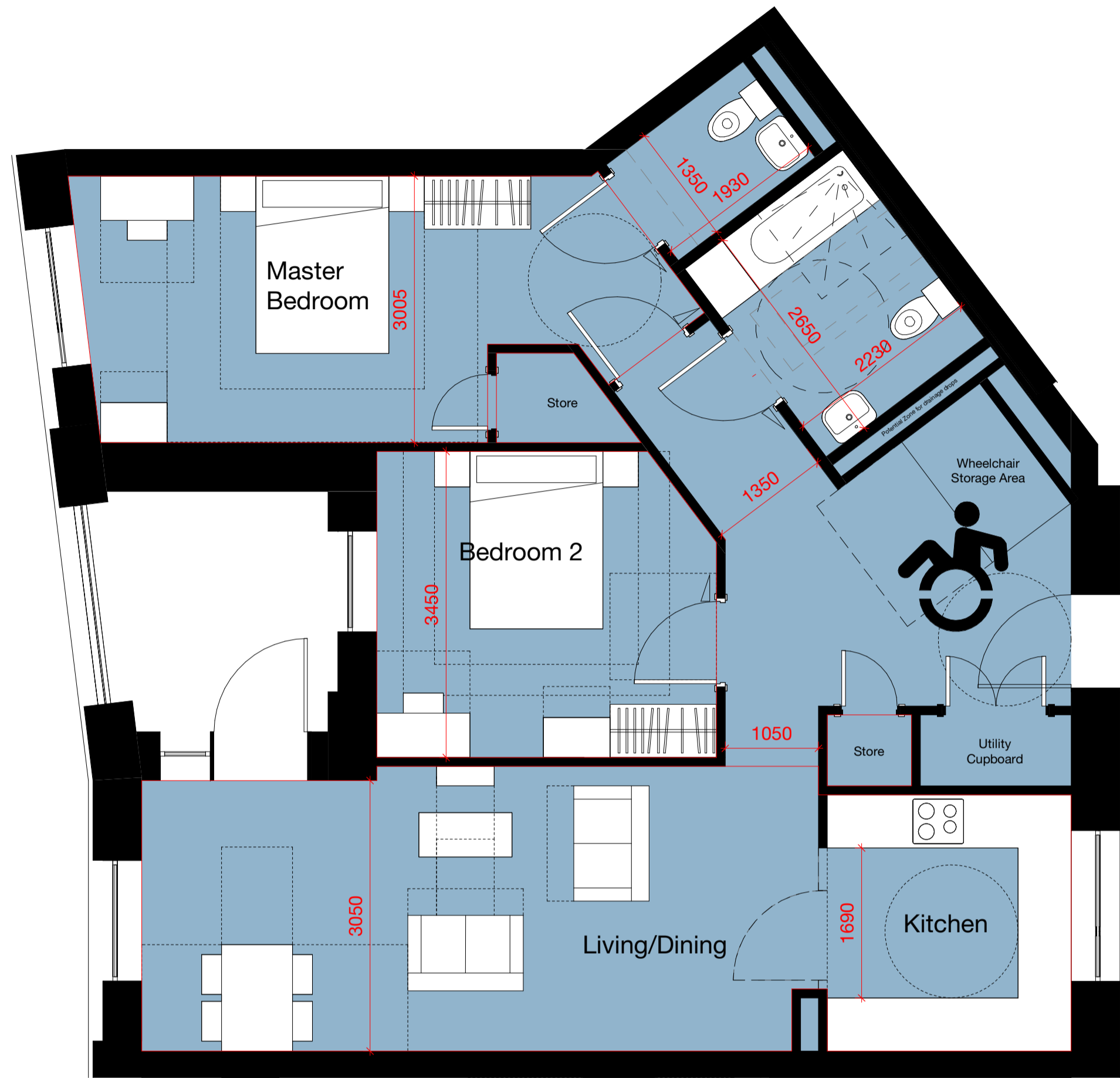
1 Courtyard - 2B4P 1 : 50

*Wheelchair Homes Design Guidelines, South East London Housing Partnership **Volume 1 Dwellings, Approved Document M, Building Regulations ***London Housing Design Guide