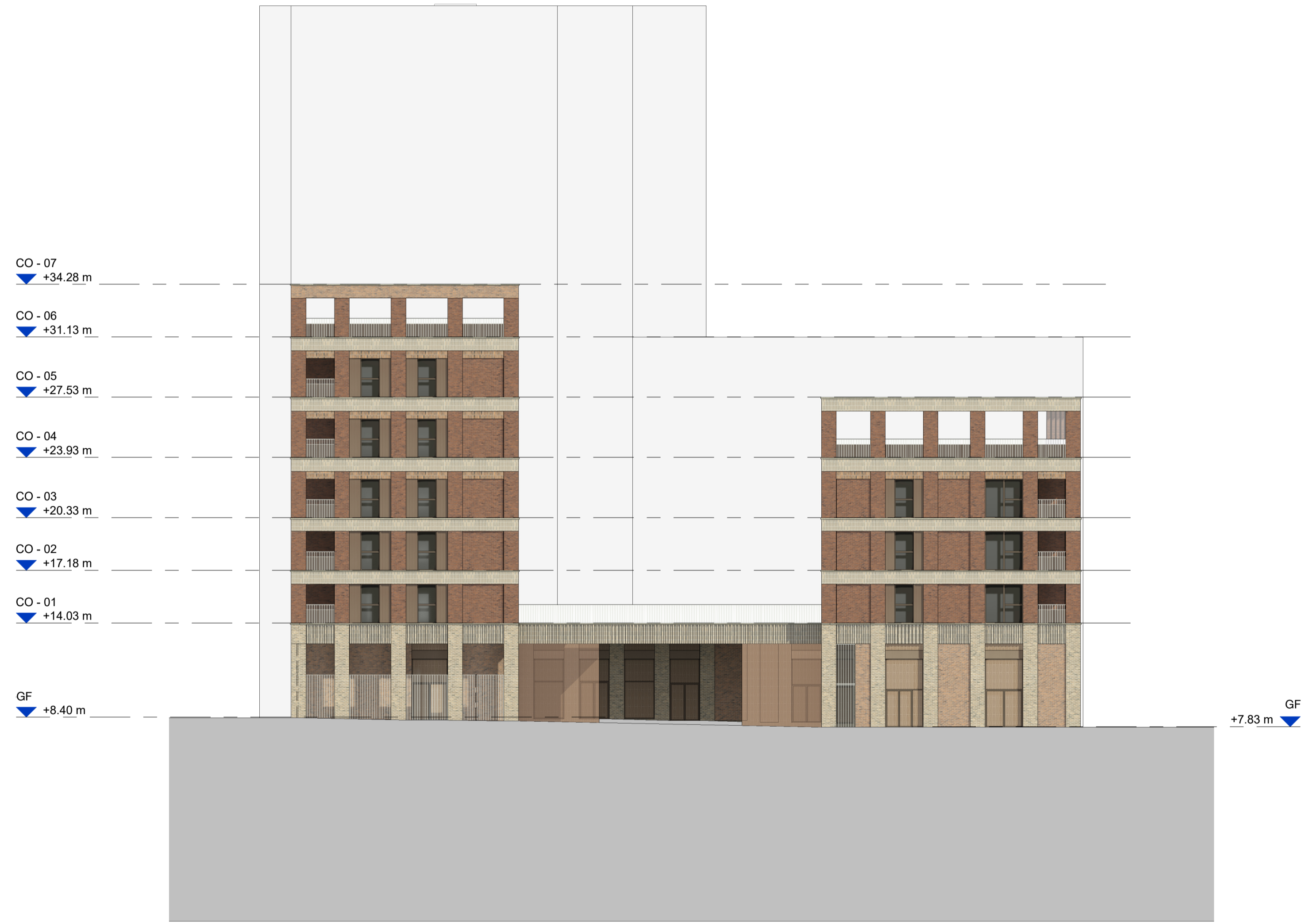
1 South Elevation 1 : 200