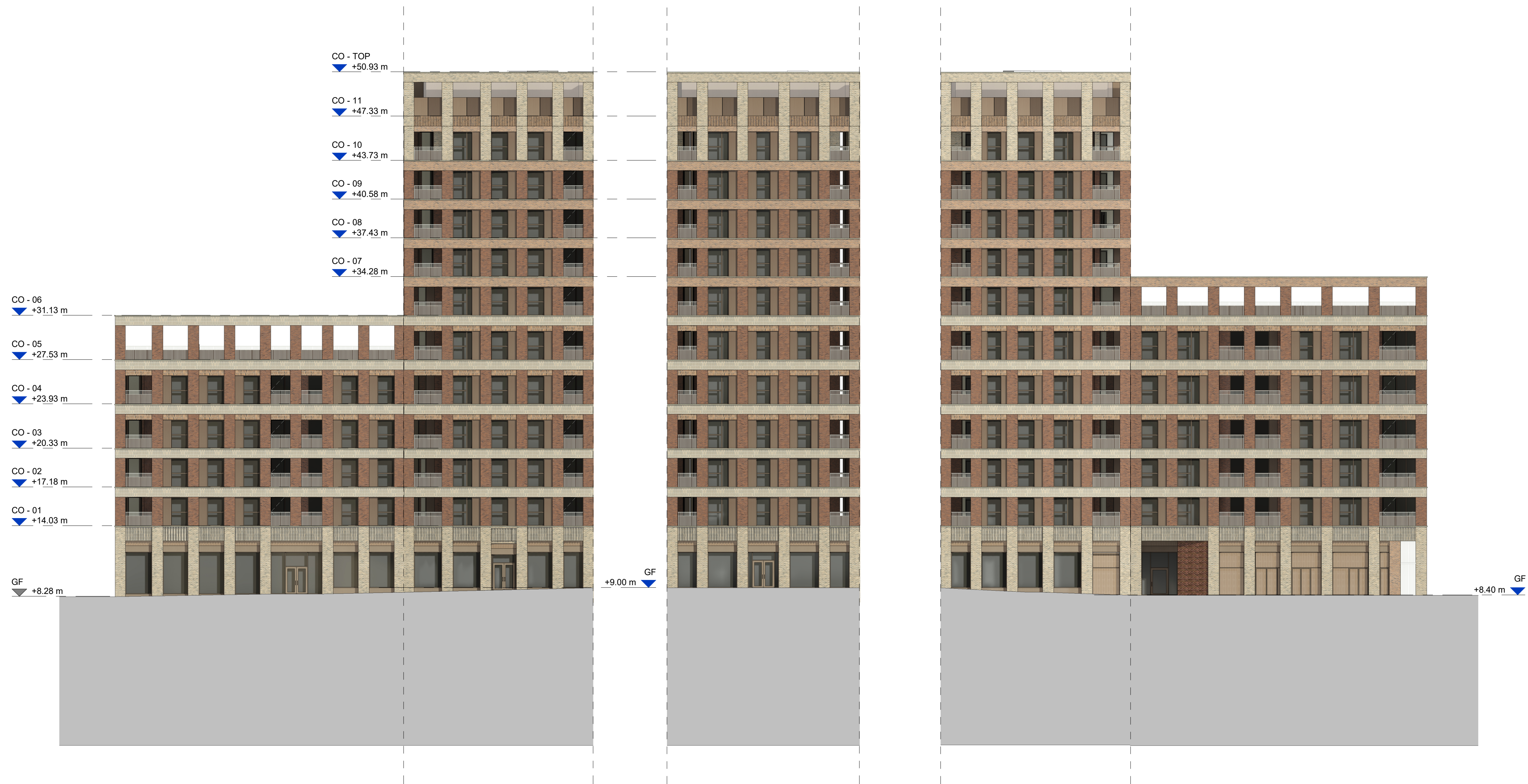
1 North Elevation 1 : 200