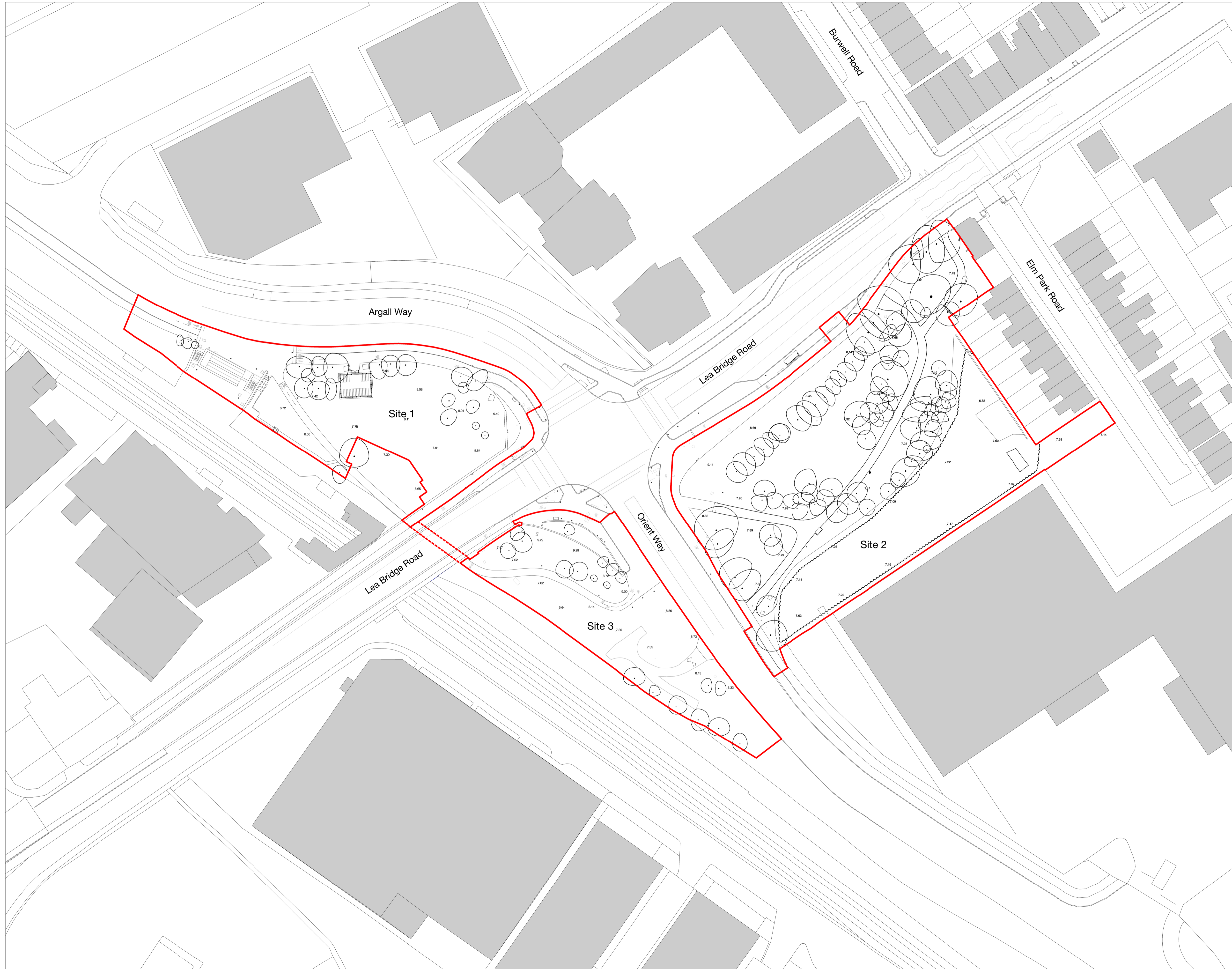
1 Existing Ground Floor Plan 1 : 500

Drawing No. LEABR-HBA-00-00-DR-A-08-0100 Rev P2