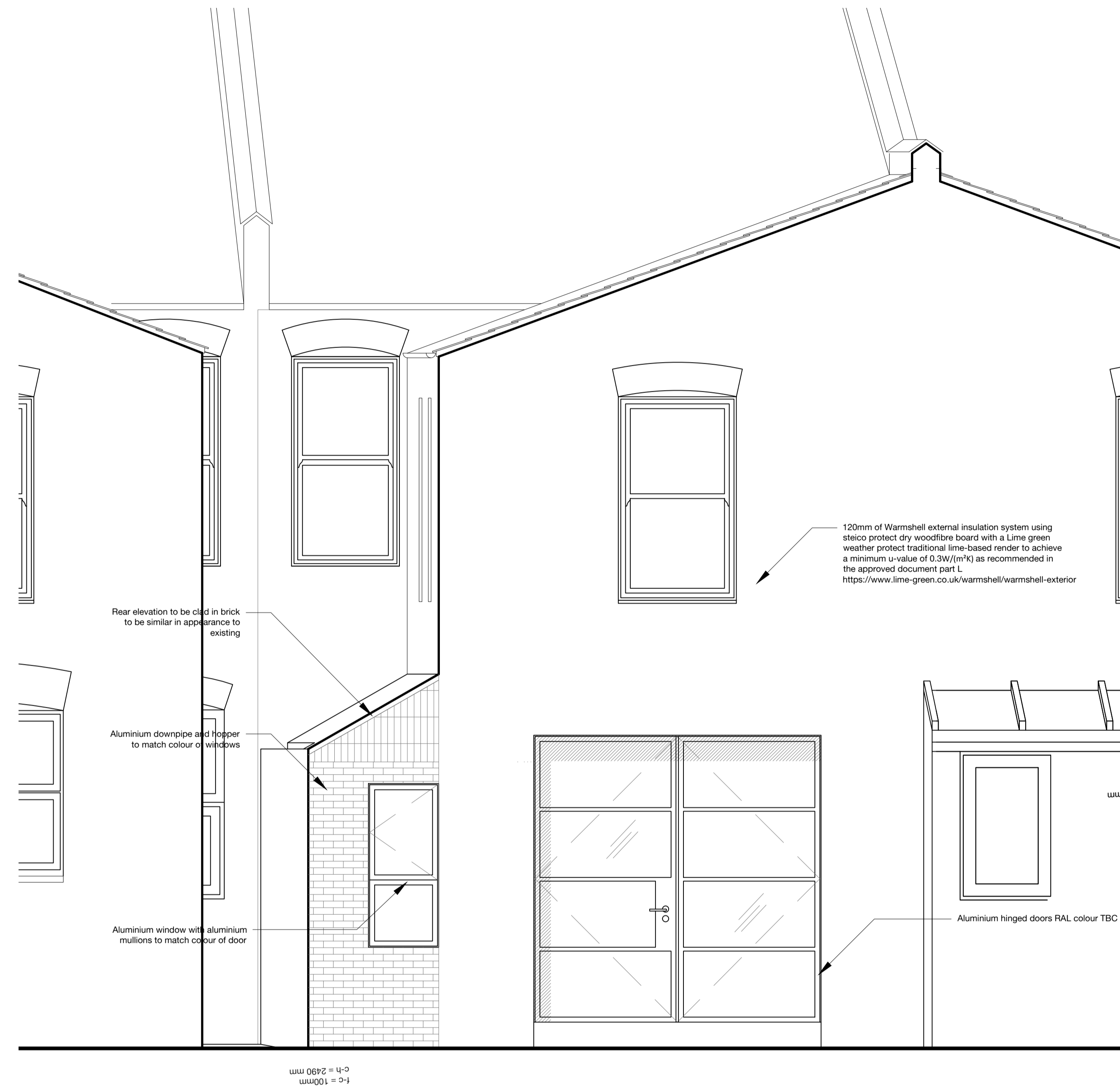
02 Rear Elevation 1:25 @ A1