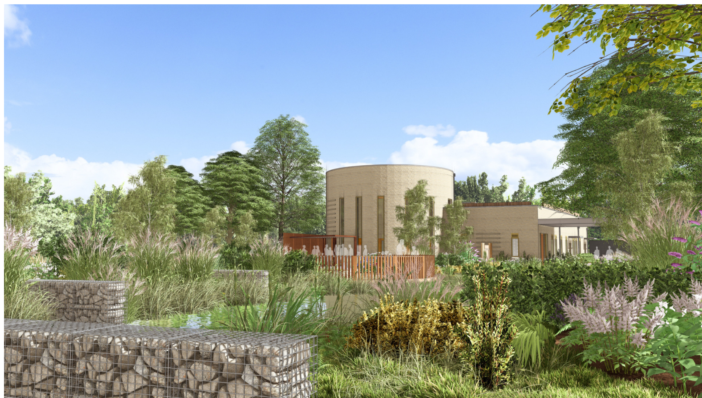
View of Building and Remembrance Garden