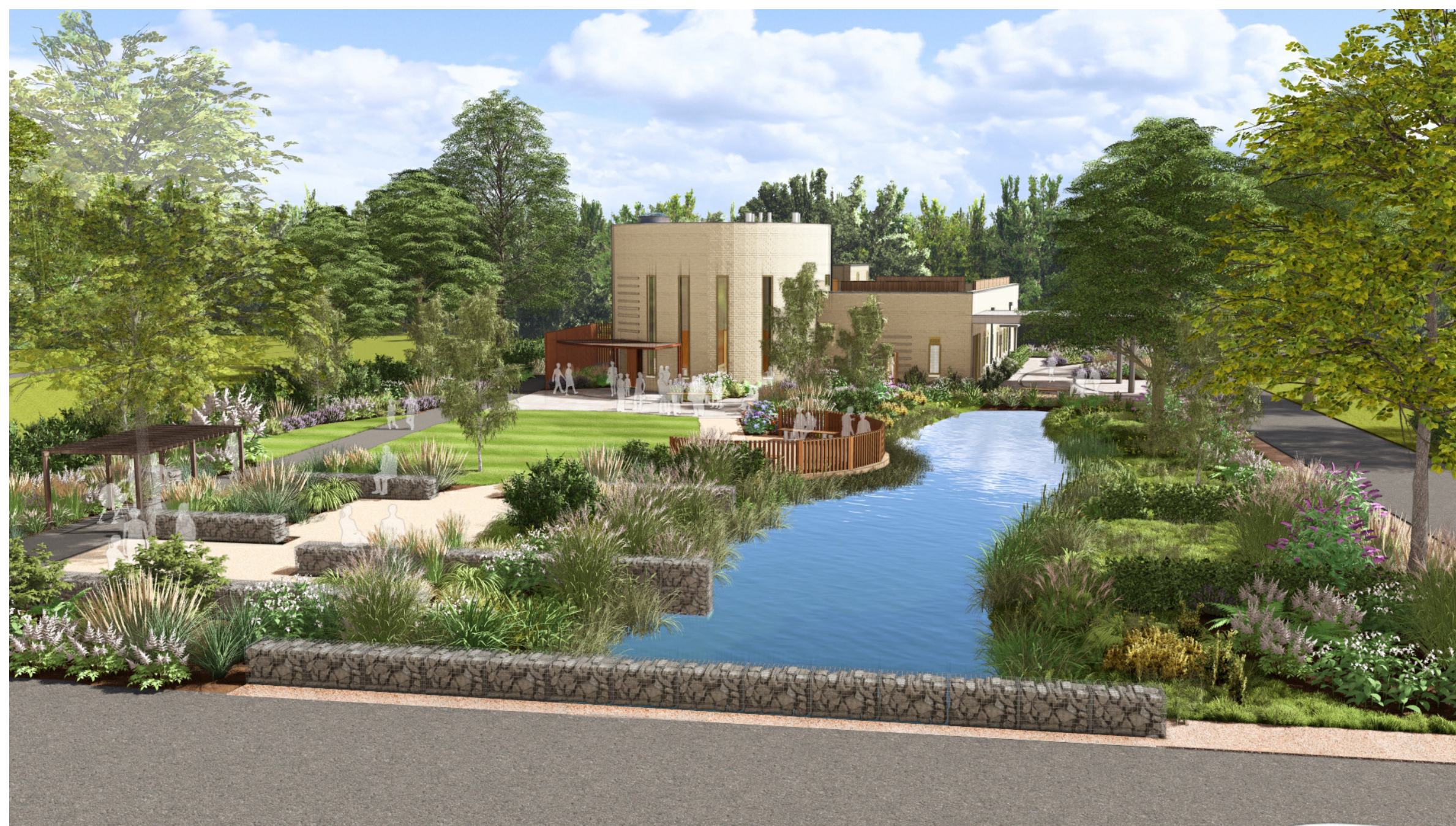
View of Building and Remembrance Garden