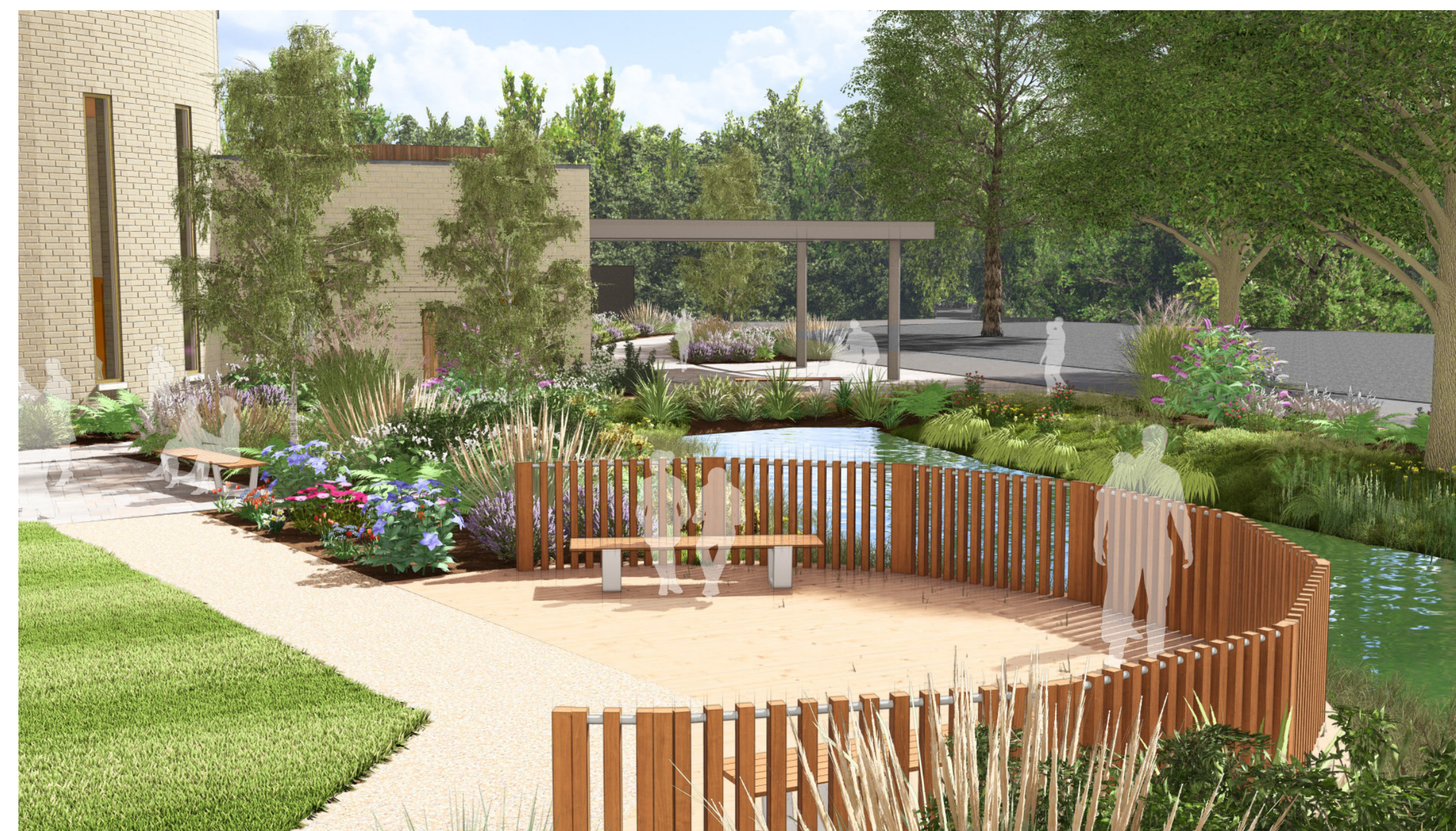
View of Remembrance Garden and Pond