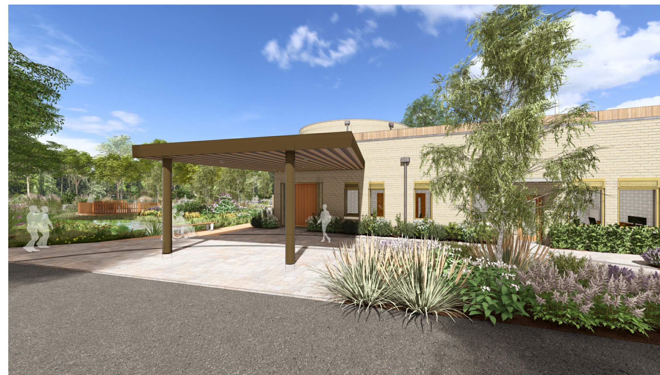
View of Main Entrance