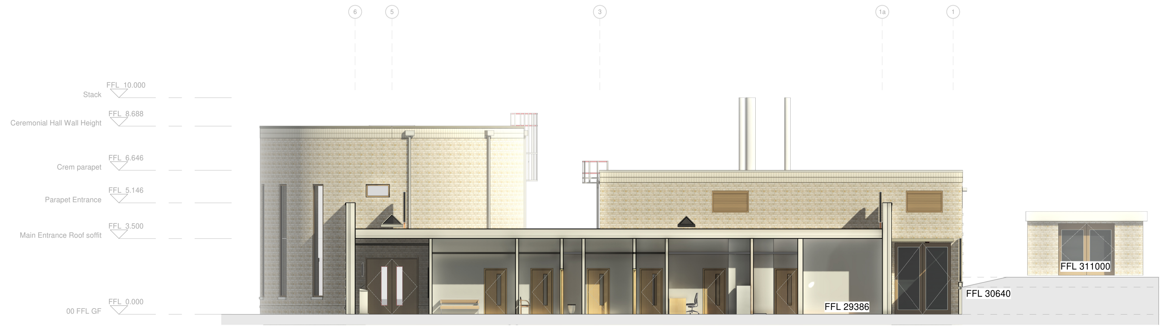
North South Section 2 1 : 100