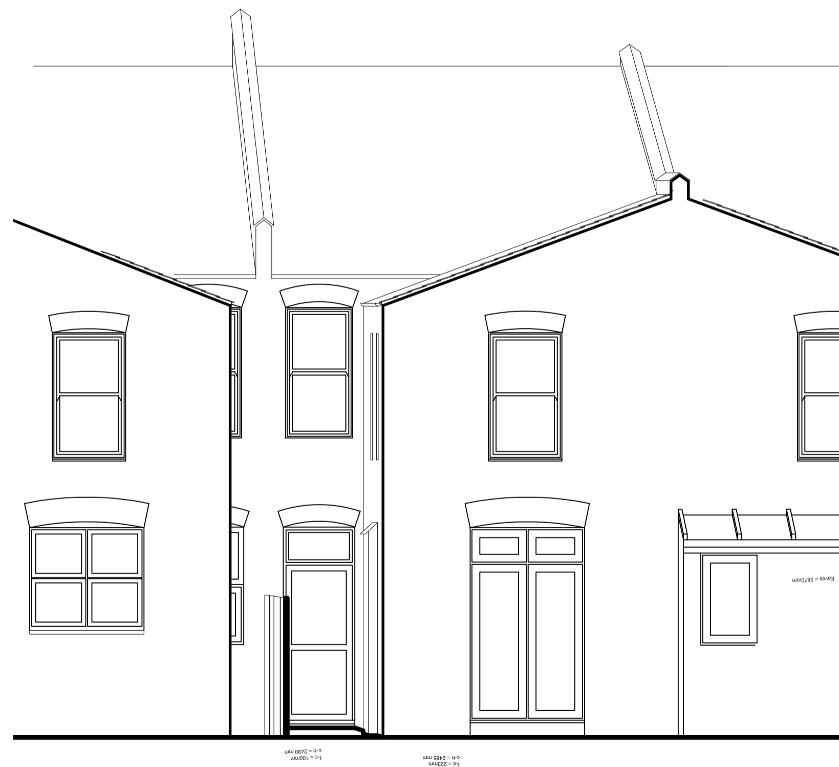
01 Rear Elevation 1:50 @ A1