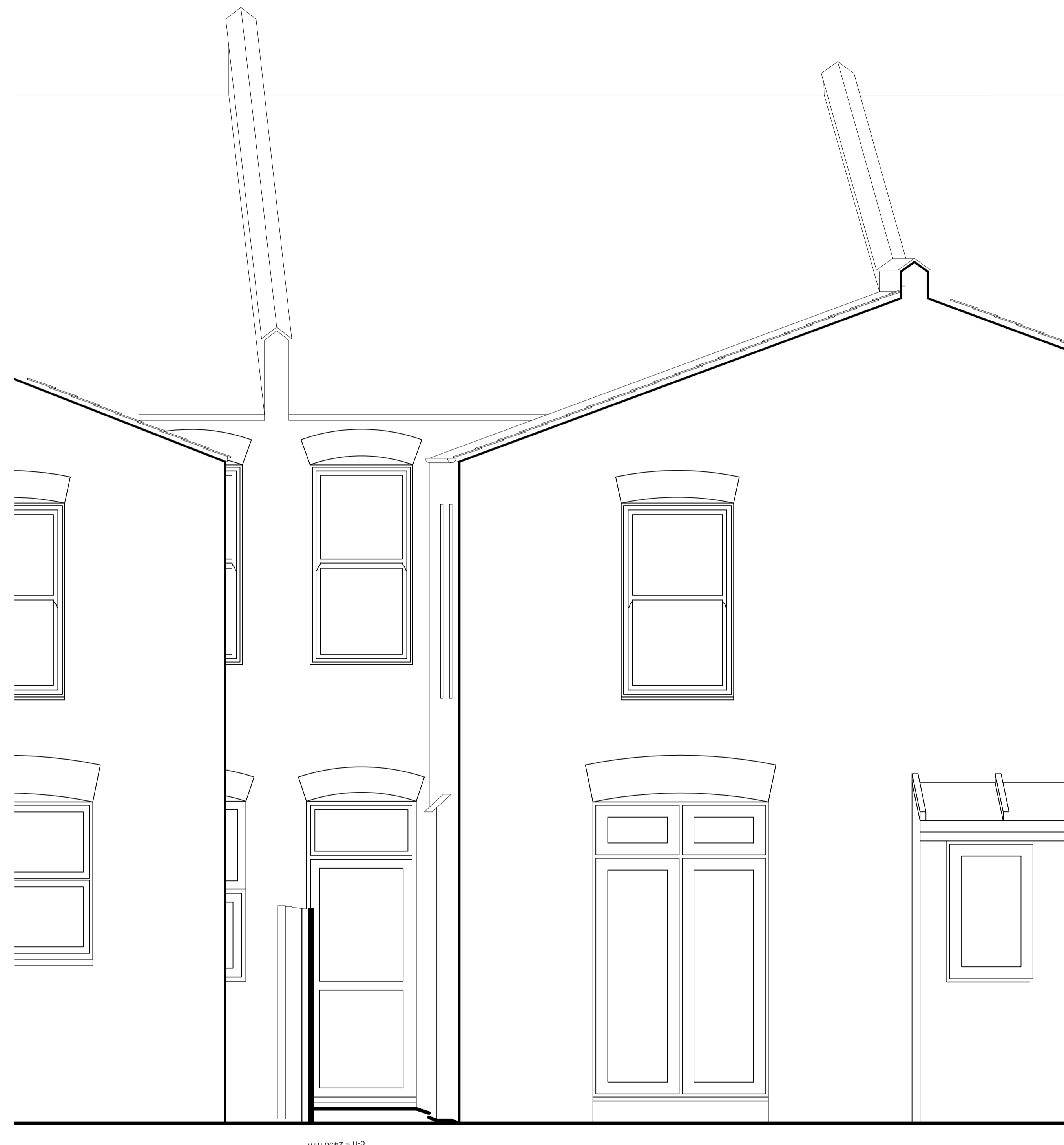
02 Rear Elevation 1:25 @ A1