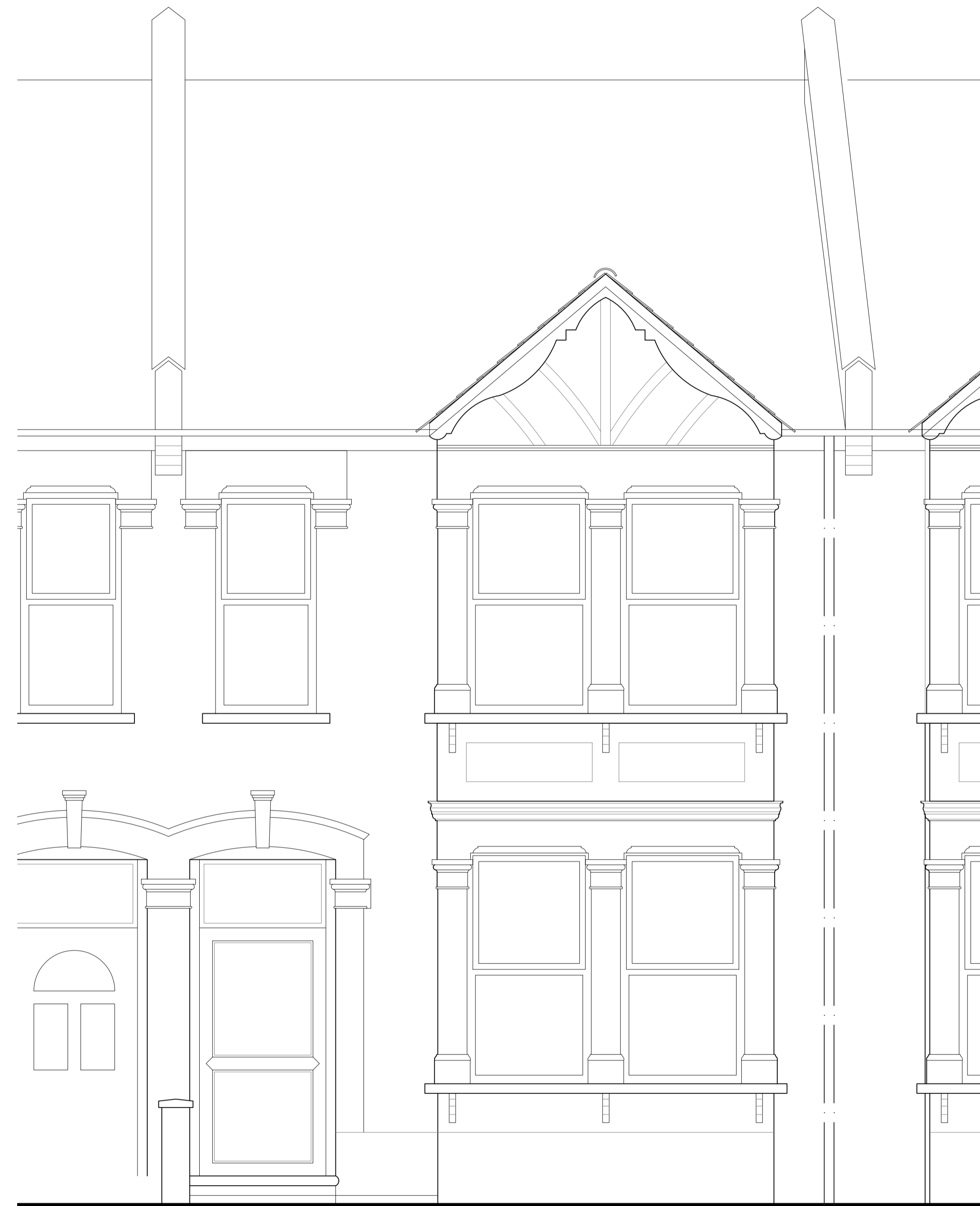
02 Front Elevation 1:25 @ A1