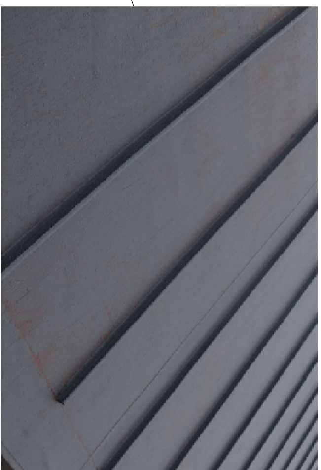
Aluminium standing seam cladding to roof pitches colour mid grey (RAL 7037)

- This drawing is prepared solely for design and planning submission purposes. It is not intended or suitable for either Building Regulations or Construction purposes and should not be used for such