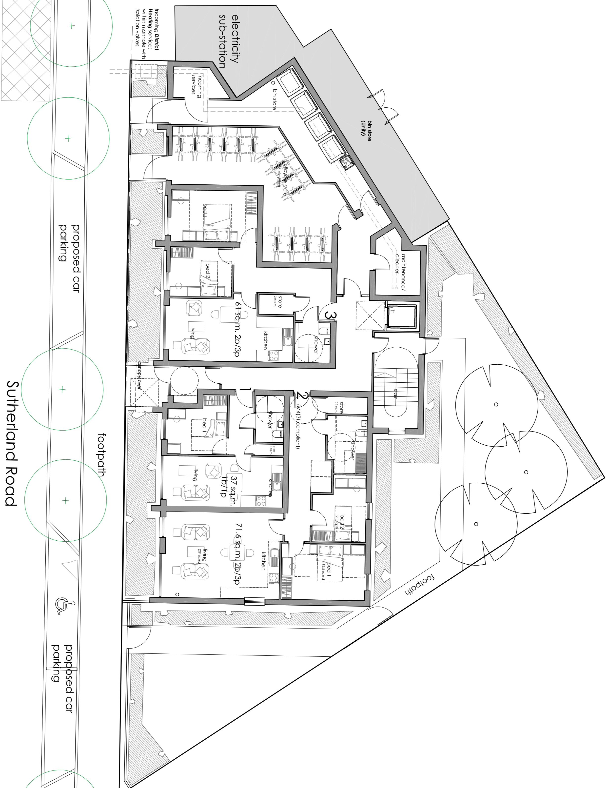
Ground Floor Plan/Site Plan scale 1:100

- This drawing is prepared solely for design and planning submission purposes. It is not intended or suitable for either Building Regulations or Construction purposes and should not be used for such