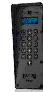
PHOTO OF THE PROPOSED VIDEO INTERCOM UNIT INBUILT FOD READER