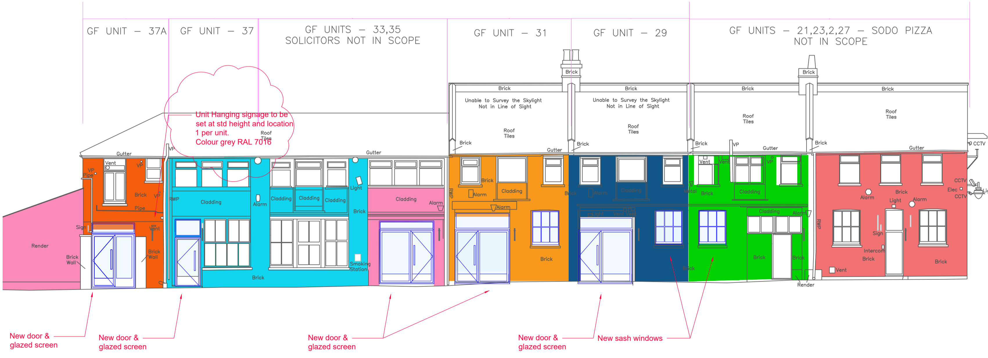
EAST BLOCK ELEVATION B