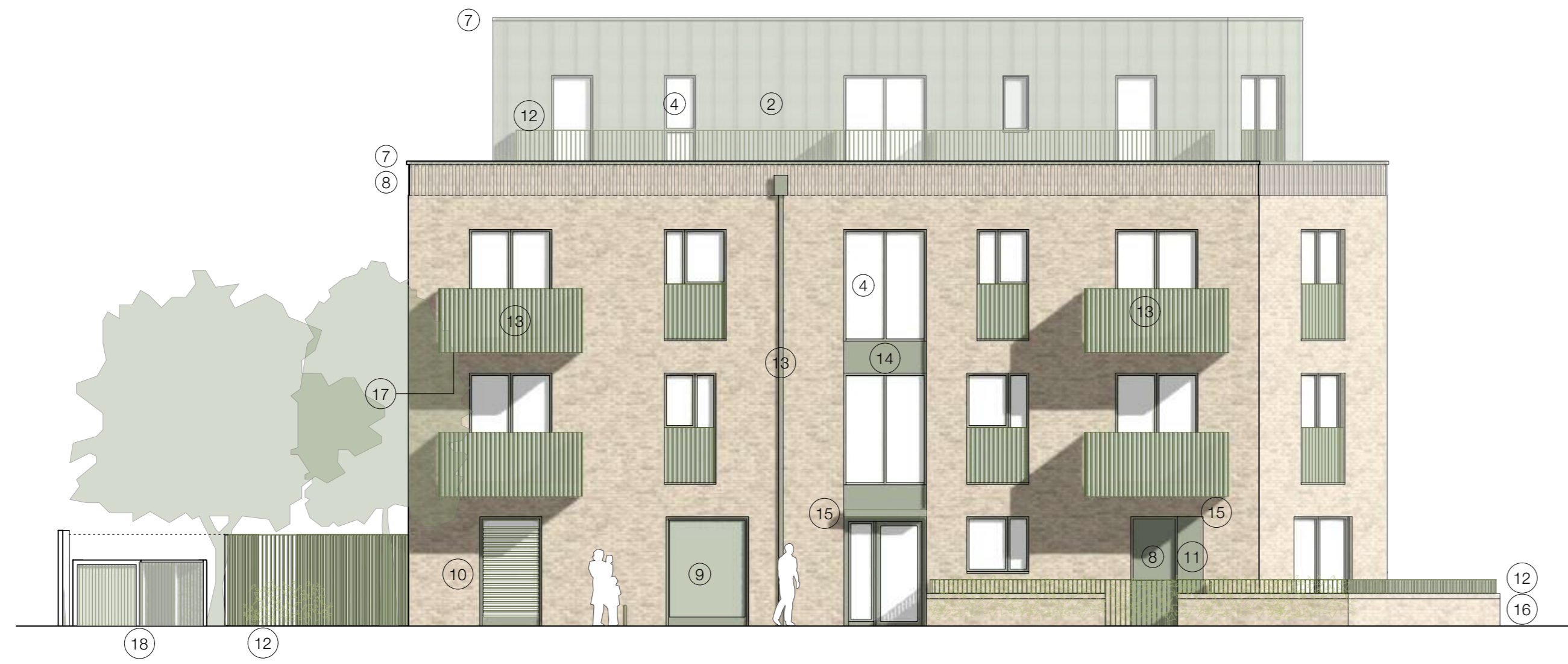
1 Block D - West Elevation