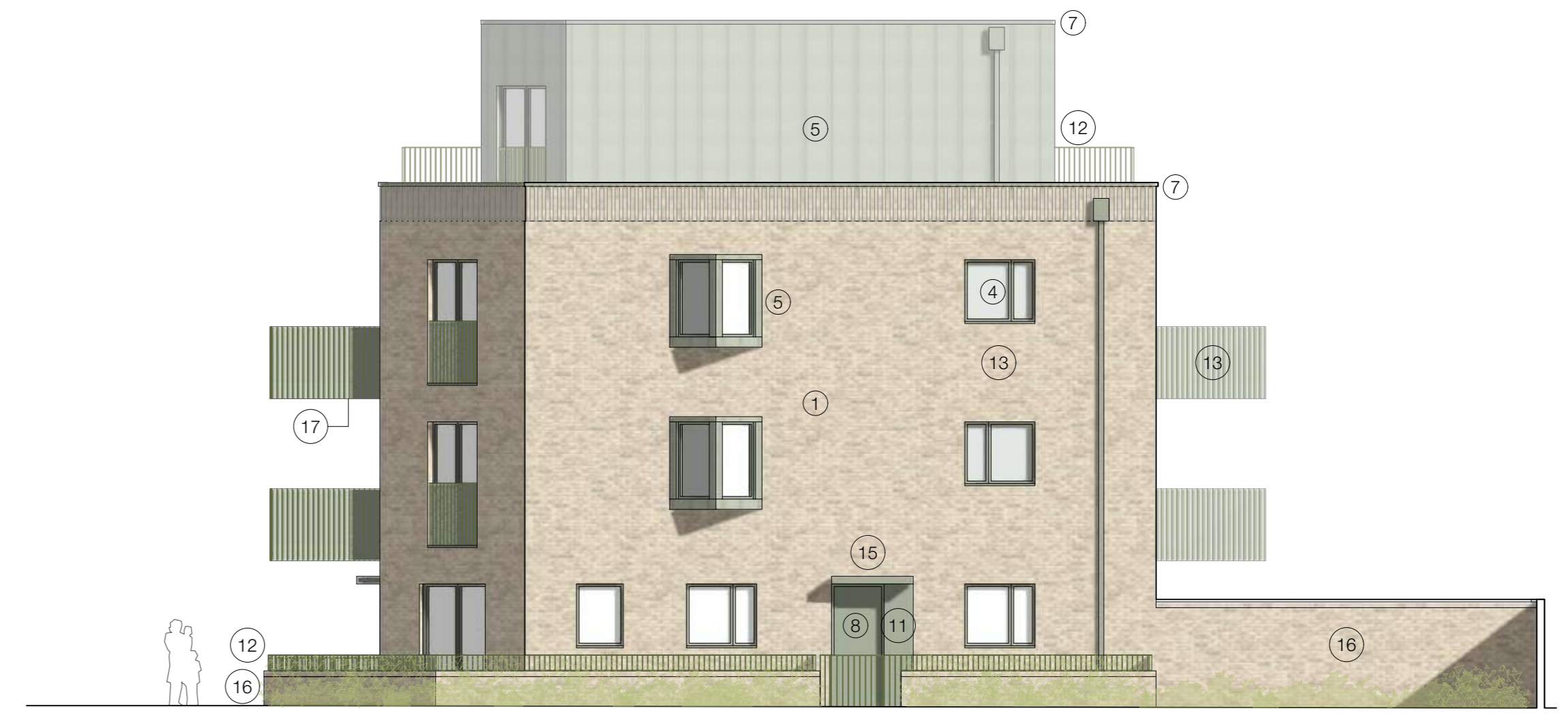
4 Block D - South Elevation

General Notes © Copyright Stephen Davy Peter Smith Architects 2023 These proposals are subject to the approval of all Statutory Building Control requirements and the requirements of all Statutory Authorities and Service Providers. The site boundaries and surroundings are based on the following: • OS Map / Measured survey by Matrix Surveys The site boundaries are those described by the client. These drawings are to be read in conjunction with all other relevant documentation produced by Stephen Davy Peter Smith Architects and other consultants employed by the client.