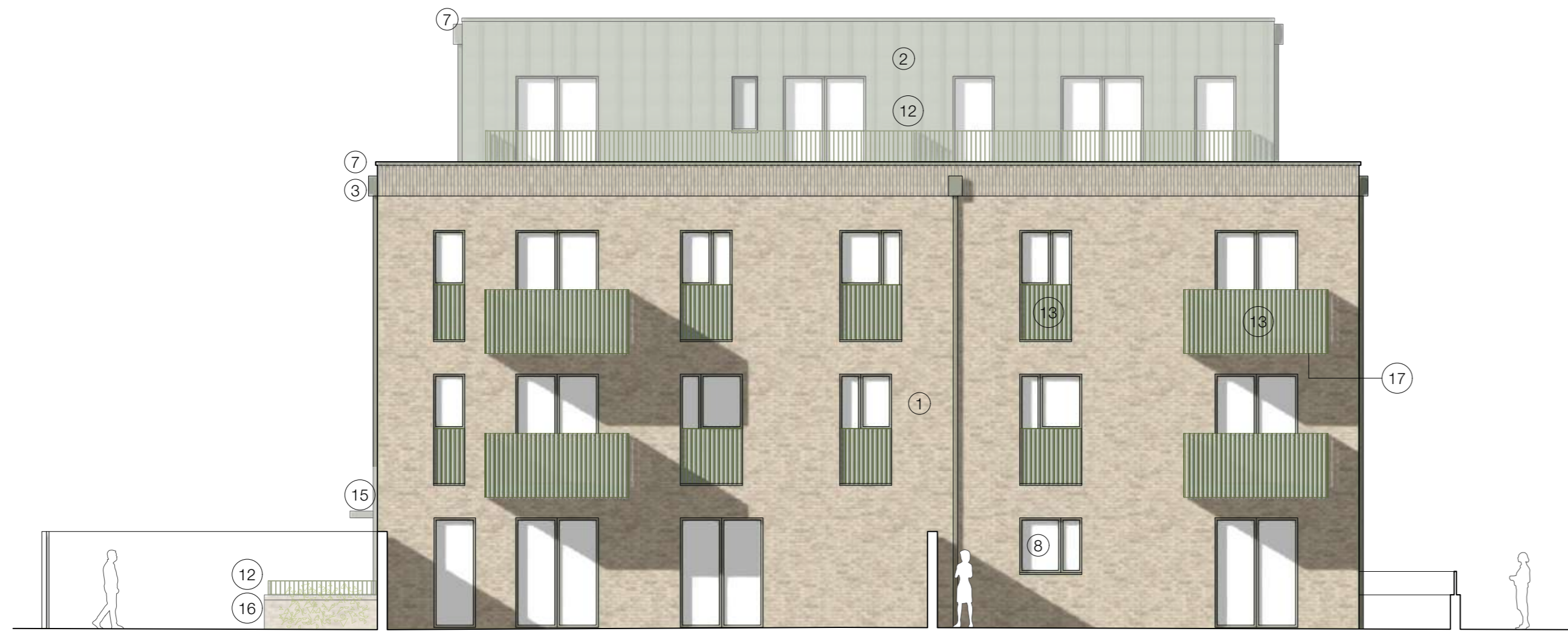
3 Block D - East Elevation