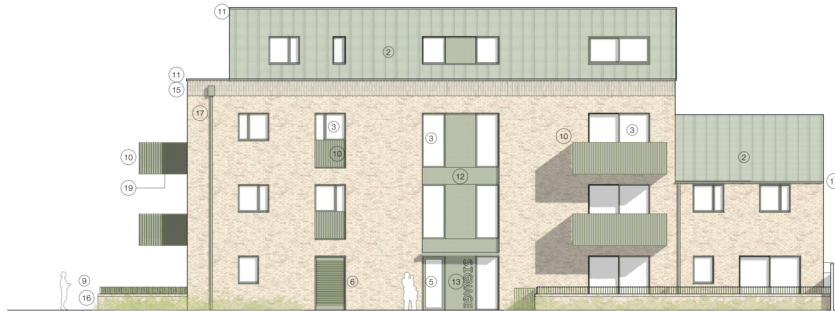
1 Block C - West Elevation