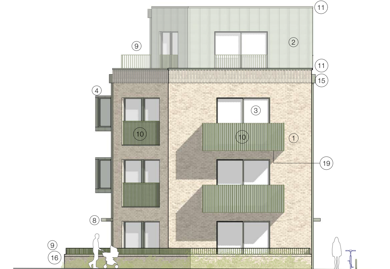
2 Block C - North Elevation