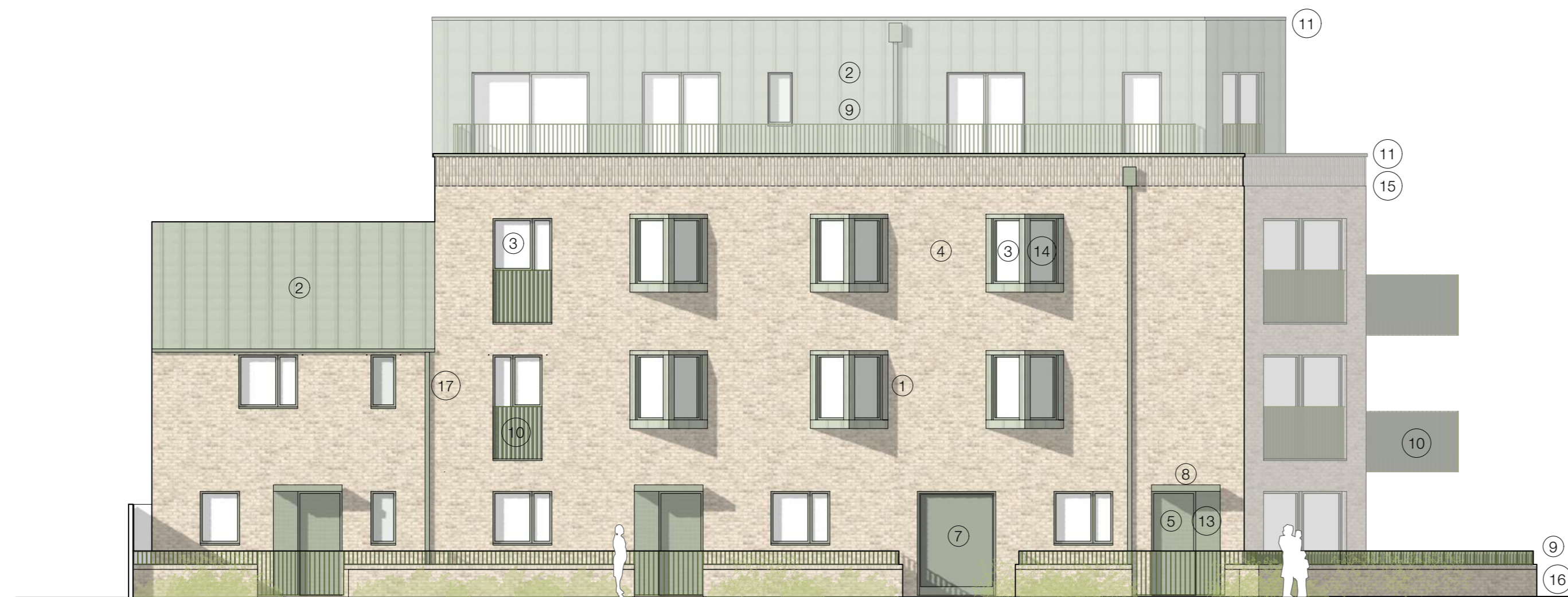
3 Block C - East Elevation