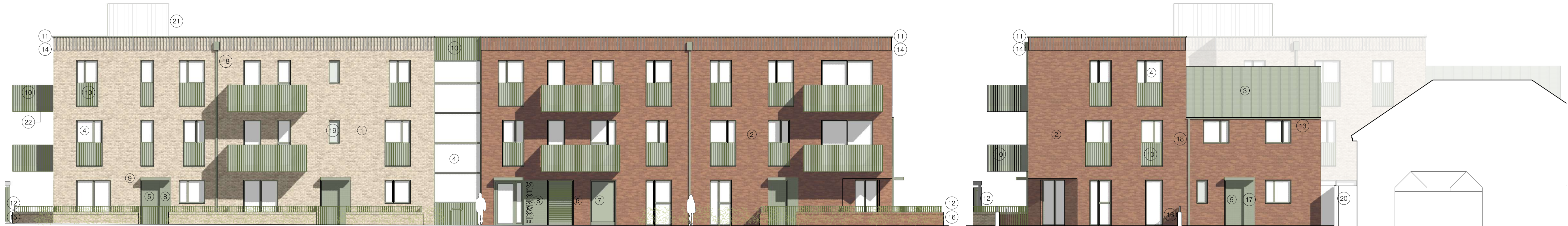
1 Block B - North Elevation