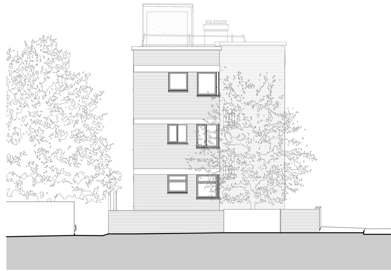
1 South East Elevation - Existing 1:100