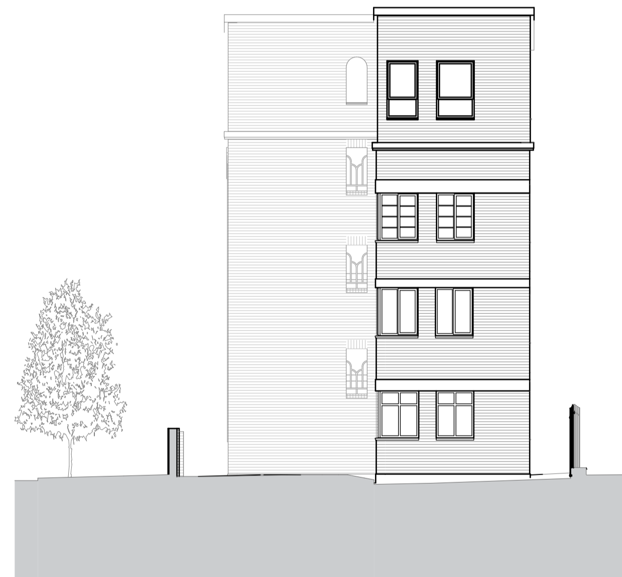
4 North West Elevation - Proposed 1:100