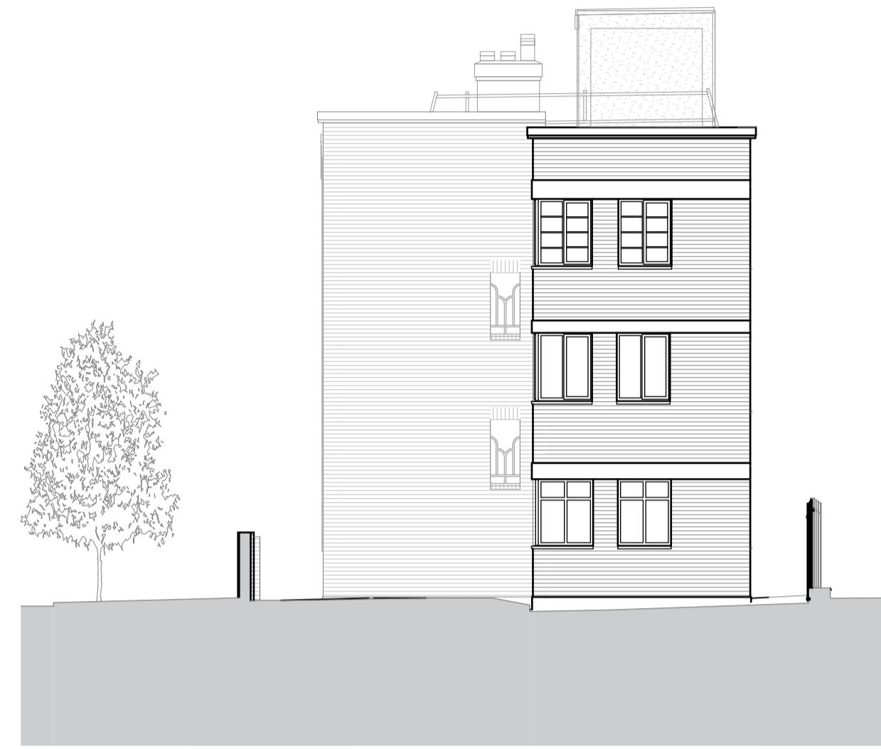
3 North West Elevation - Existing 1:100