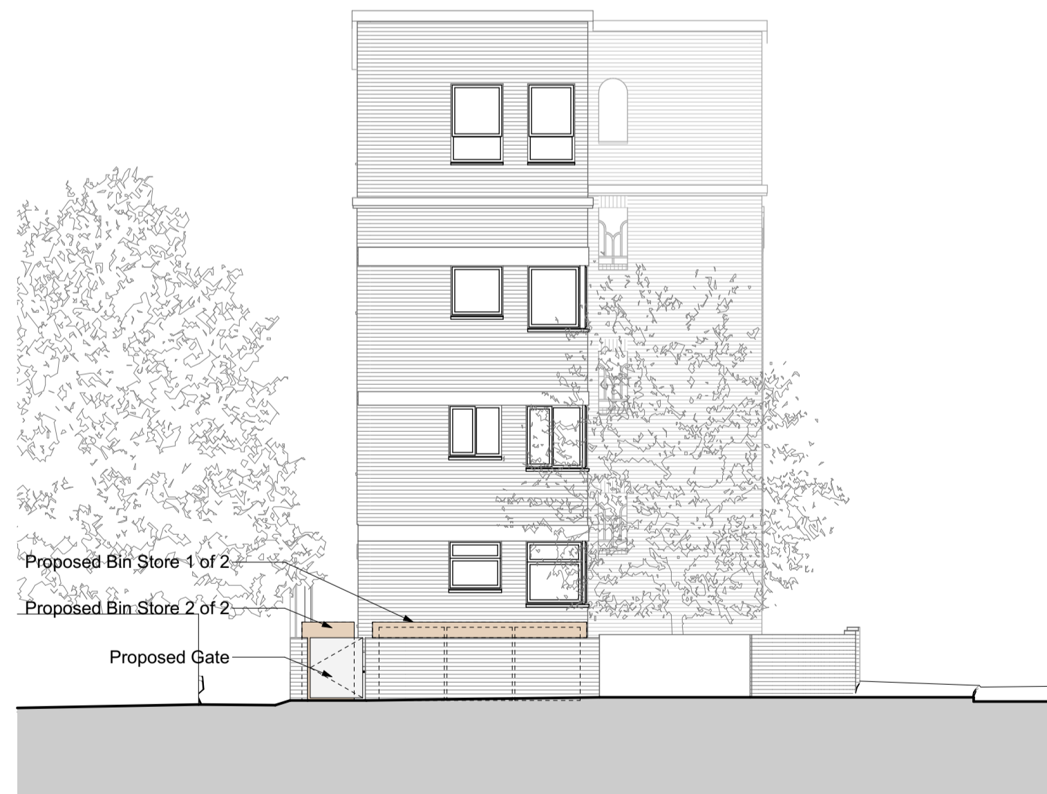
2 South East Elevation - Proposed 1:100