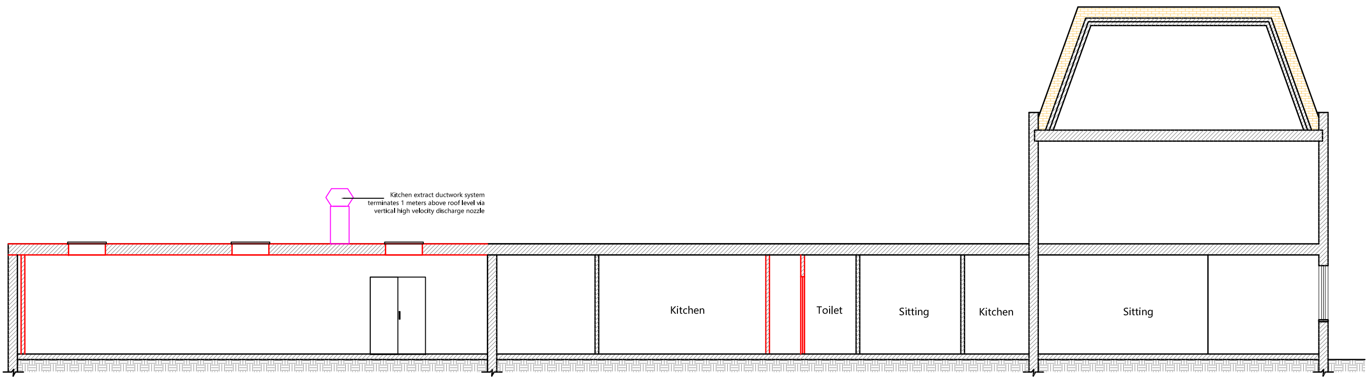
PROPOSED SECTION X-X

PROJECT ADDRESS 37 AND REAR OF 37 ORFORD ROAD LONDON E17 9NL