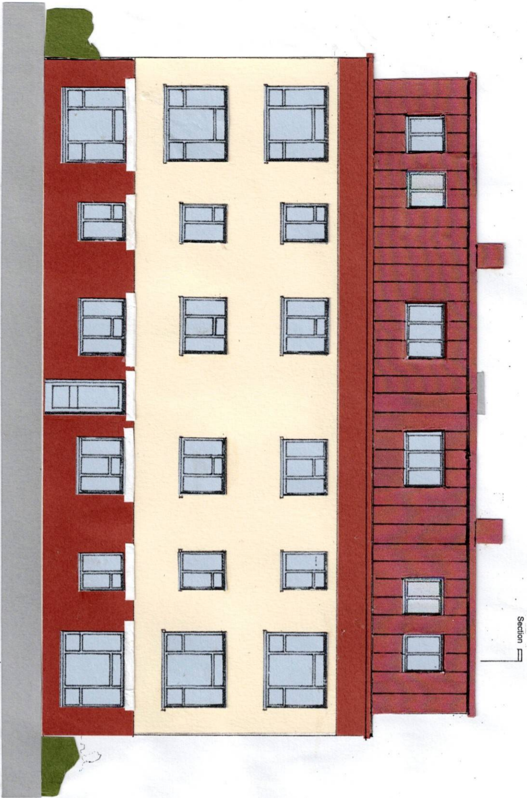
PROPOSED WEST (REAR) ELEVATION